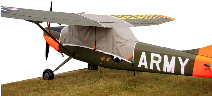
L-19 Canopy Cover (similar to Siai Marchetti 1019)