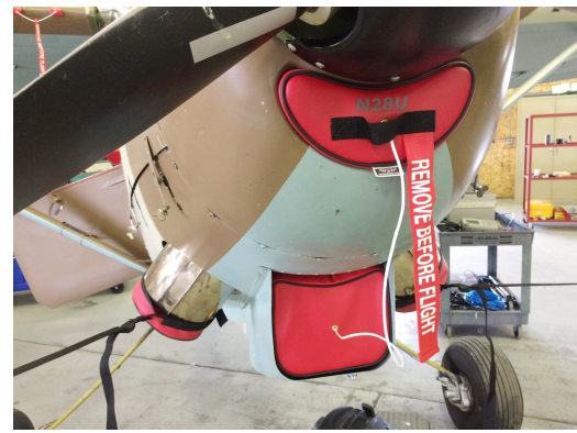
Siai Marchetti 1019 Engine Plugs, Prop Tie-Exhaust Covers