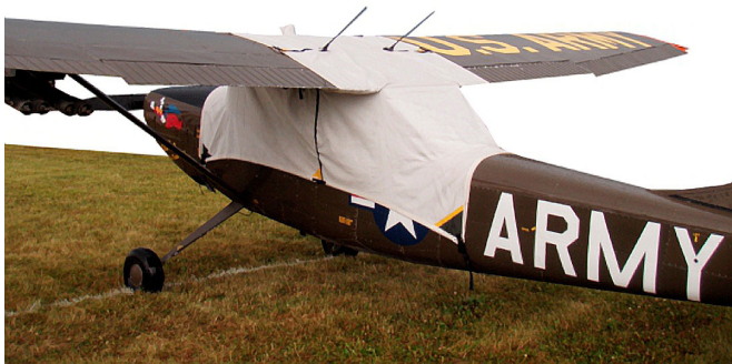
L-19 Canopy Cover (similar to Siai Marchetti 1019)

This cover type is made from Silver Acrylic Sunbrella canvas and is 100% lined with a soft and smooth microfiber. Bruce's Custom Covers developed this material combination especially for aircraft protection. The outer material is medium weight and treated for water resistance, UV resistance and anti-static buildup. The inner lining is a very soft and smooth microfiber to prevent scratching. The material is very reflective, and tests show that the cabin interior temperature can be reduced to near-ambient temperature on the hottest of days. It is water, ice and snow repellent, yet breathable to allow moisture to escape from between the cover and the aircraft surface.