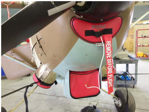
Siai Marchetti 1019 Engine Plugs, Prop Tie-Exhaust Covers