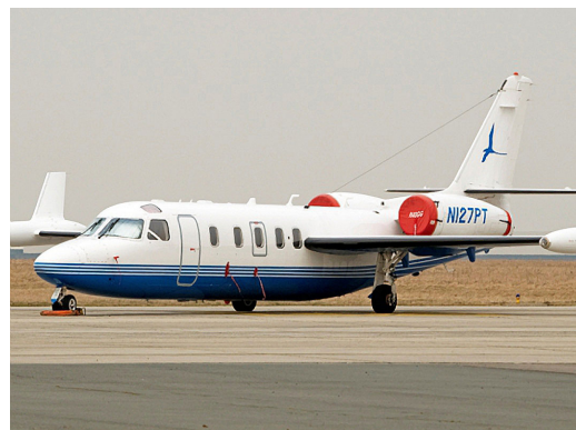
Engine Covers & Cockpit HeatShields