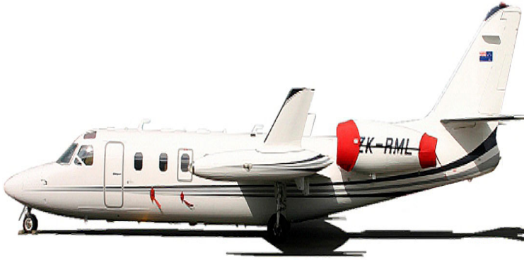
Jet Commander Engine Covers

instructions. The aircraft's registration number can be silkscreened onto the cover for an extra charge.