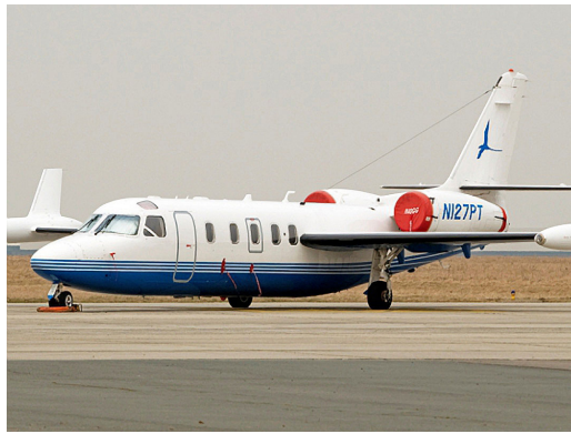
Engine Covers & Cockpit HeatShields

Cockpit Heatshields are interior sunshades for the aircraft's cockpit. The product is a unique composite of closed-cell foam with a silver mylar finish. The semi-rigid design is stiff enough to stand inside the window framing. The set folds up flat and is easily stored in the included storage sleeve. Some designs may require velcro and suction cups. Our Heatshields for jets are offered white side out because some aircraft manufacturers have issued advisories against reflective window inserts due to potential heat damage. A Heatshield is an excellent short-term remedy for cockpit overheating, but an external fabric cover is more effective for long-term protection.