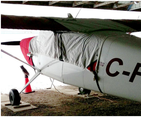
Cessna 170 Insulated Engine Cover