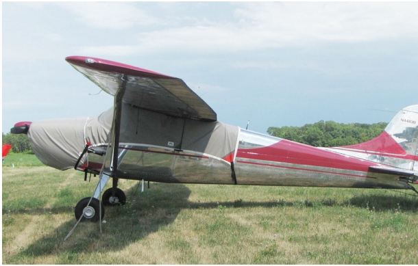
Cessna 170B Canopy & Engine Covers

This cover type is made from Silver Acrylic Sunbrella canvas and is 100% lined with a soft and smooth microfiber. Bruce's Custom Covers developed this material combination especially for aircraft protection. The outer material is medium weight and treated for water resistance, UV resistance and anti-static buildup. The inner lining is a very soft and smooth microfiber to prevent scratching. The material is very reflective, and tests show that the cabin interior temperature can be reduced to near-ambient temperature on the hottest of days. It is water, ice and snow repellent, yet breathable to allow moisture to escape from between the cover and the aircraft surface.