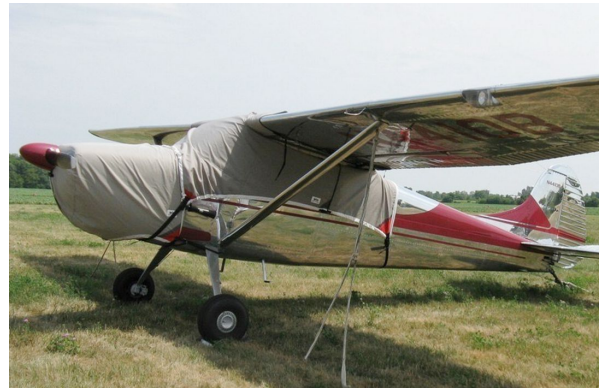
Cessna 170B Canopy & Engine Covers