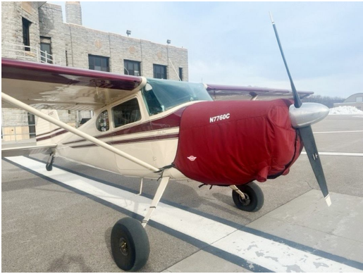
Cessna 170B Insulated Engine Cover