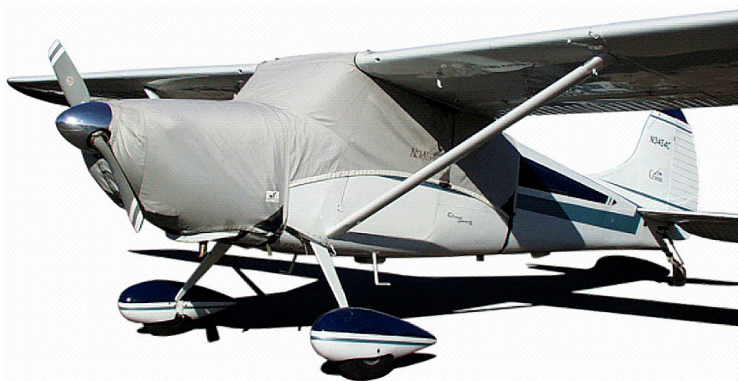
Cessna 170 Canopy Cover & Engine Cover

This cover type is made from Silver Acrylic Sunbrella canvas and is 100% lined with a soft and smooth microfiber. Bruce's Custom Covers developed this material combination especially for aircraft protection. The outer material is medium weight and treated for water resistance, UV resistance and anti-static buildup. The inner lining is a very soft and smooth microfiber to prevent scratching. The material is very reflective, and tests show that the cabin interior temperature can be reduced to near-ambient temperature on the hottest of days. It is water, ice and snow repellent, yet breathable to allow moisture to escape from between the cover and the aircraft surface.