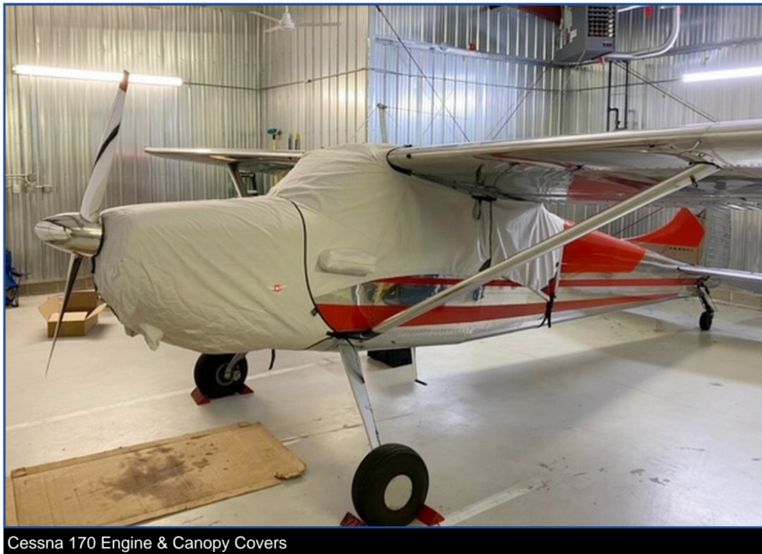
Cessna 170 Engine &amp; Canopy Covers