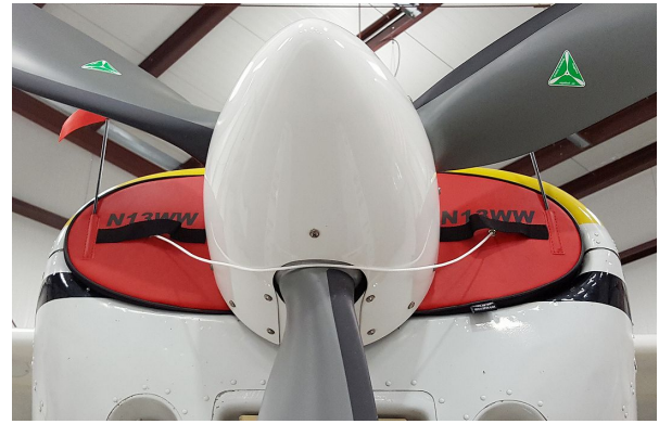
Cessna 180/185 Skywagon Engine Inlet Plugs