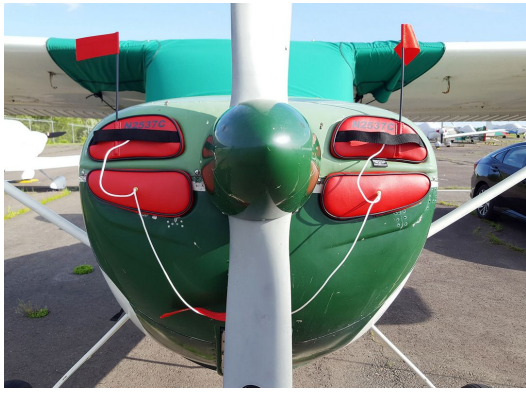
1954 Cessna 170B Engine Inlet Plugs