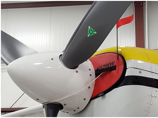
Cessna 180/185 Skywagon Engine Inlet Plugs