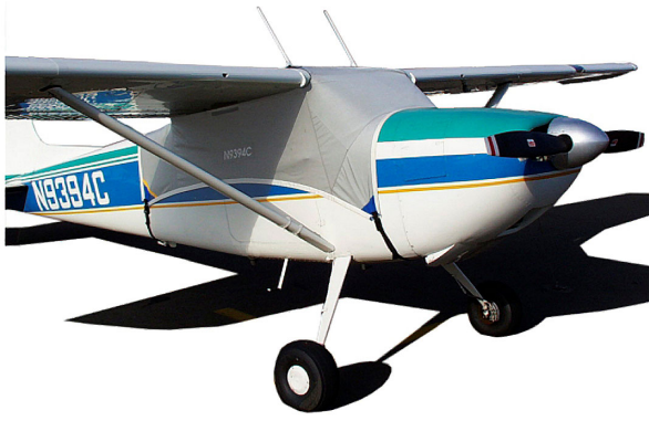
Cessna 180 Canopy Cover