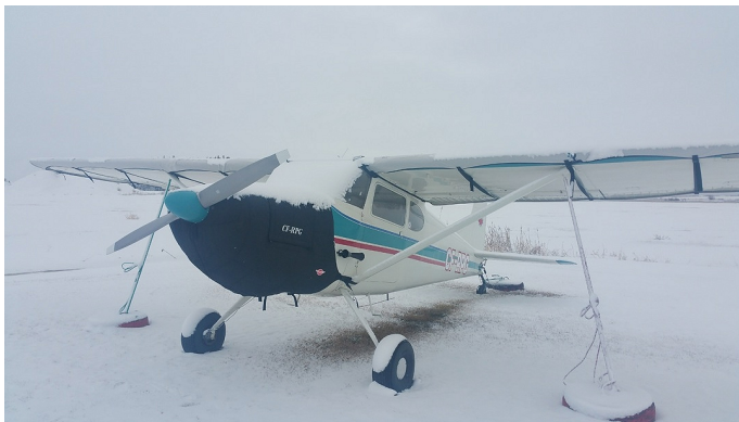
Cessna 170 Insulated Engine Cover, Wing Covers

WINTER USE MATERIAL - Made with Solution-Dyed Polyester fabric, this option is intended for seasonal use to aid in deicing, rain mitigation, or for occasional travel. The material is lighter and more compact, but more susceptible to UV damage and may have a shorter useful life if used continuously outside than the all-year use material.