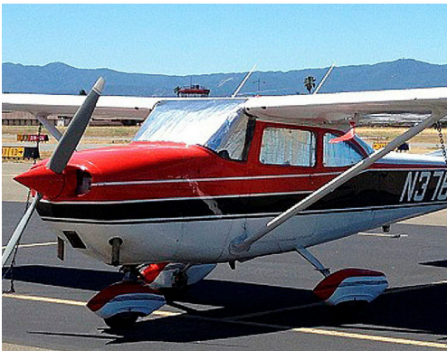
Cessna 172 Cabin HeatShields