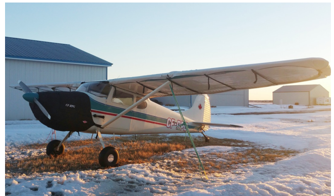
Cessna 170 Insulated Engine Cover, Wing Covers