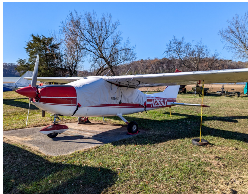
Cessna 177 Cardinal Engine Inlet Plugs, Fixed Gear Models (1968-72)