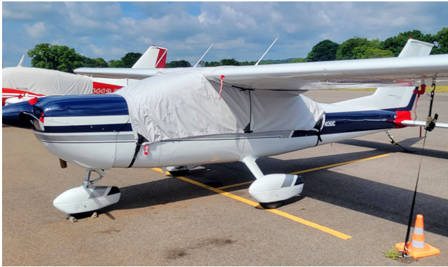
Cessna 177B Canopy Cover, Over Top Type