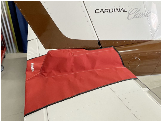
Cessna 177 Cardinal Tailcone Cover, Fully Enclosed

shorter useful life if used continuously outside than the all-year use material.