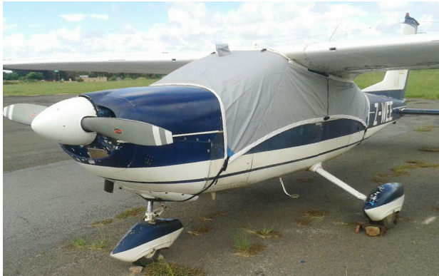
Cessna 177 Cardinal Travel Canopy Cover