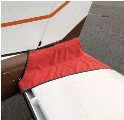
Cessna Cardinal RG Tailcone Cover