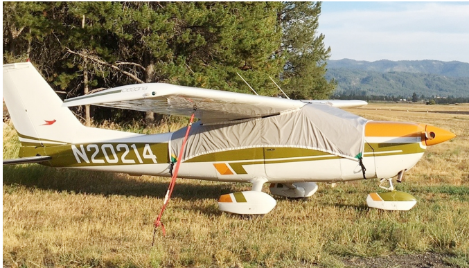
Cessna 177 Cardinal Travel Cover, Light Weight Travel Canopy Cover (Wrap Around), 6 Lbs

Travel Covers are made with Silver Solution-Dyed Polyester fabric and only lined over the windshield to save weight. The material is lightweight and more compact for easy stowage in the aircraft. The polyester material is water resistant, but only intended for occasional use outside. We also have an ultra lightweight material available for fitted hangar dust covers. For daily outdoor use, the non-travel Sunbrella Cover is the best choice.