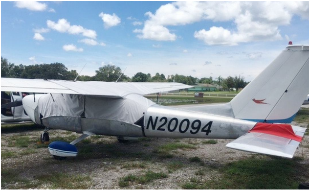
Cessna 177 Cardinal Canopy Cover

This cover type is made from Silver Acrylic Sunbrella canvas and is 100% lined with a soft and smooth microfiber. Bruce's Custom Covers developed this material combination especially for aircraft protection. The outer material is medium weight and treated for water resistance, UV resistance and anti-static buildup. The inner lining is a very soft and smooth microfiber to prevent scratching. The material is very reflective, and tests show that the cabin interior temperature can be reduced to near-ambient temperature on the hottest of days. It is water, ice and snow repellent, yet breathable to allow moisture to escape from between the cover and the aircraft surface.