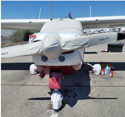
Cessna 177B Cardinal Canopy Cover, Over-Top, Ext. to cover gas caps, 6" fwd extension. Cessna 177RG Tire & Prop Covers