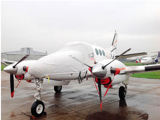
King Air Cockpit/Nose Cover, Plugs, Prop Tie/Exhaust Covers

The Beech 1900C Nose Cover is designed to cover the section of the fuselage forward of the windshield to the tip of the nose. It is secured with belly strapsThis cover type is made from Silver Acrylic Sunbrella canvas and is 100% lined with a soft and smooth microfiber. Bruce's Custom Covers developed this material combination especially for aircraft protection. The outer material is medium weight and treated for water resistance, UV resistance and anti-static buildup. The inner lining is a very soft and smooth microfiber to prevent scratching. The material is very reflective, and tests show that the cabin interior temperature can be reduced to near-ambient temperature on the hottest of days. It is water, ice and snow repellent, yet breathable to allow moisture to escape from between the cover and the aircraft surface.