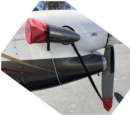
Beech King Air 350 Prop Tie-Downs/Exhaust Covers Combination

This cover type is made from Silver Acrylic Sunbrella canvas and is 100% lined with a soft and smooth microfiber. Bruce's Custom Covers developed this material combination especially for aircraft protection. The outer material is medium weight and treated for water resistance, UV resistance and anti-static buildup. The inner lining is a very soft and smooth microfiber to prevent scratching. The material is very reflective, and tests show that the cabin interior temperature can be reduced to near-ambient temperature on the hottest of days. It is water, ice and snow repellent, yet breathable to allow moisture to escape from between the cover and the aircraft surface.