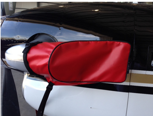
King Air Exhaust Stack Cover

This cover type is made from Silver Acrylic Sunbrella canvas and is 100% lined with a soft and smooth microfiber. Bruce's Custom Covers developed this material combination especially for aircraft protection. The outer material is medium weight and treated for water resistance, UV resistance and anti-static buildup. The inner lining is a very soft and smooth microfiber to prevent scratching. The material is very reflective, and tests show that the cabin interior temperature can be reduced to near-ambient temperature on the hottest of days. It is water, ice and snow repellent, yet breathable to allow moisture to escape from between the cover and the aircraft surface.