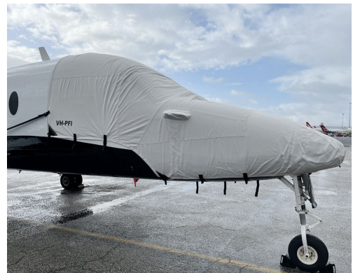
Raytheon/Beech 1900D Cockpit/Nose Cover