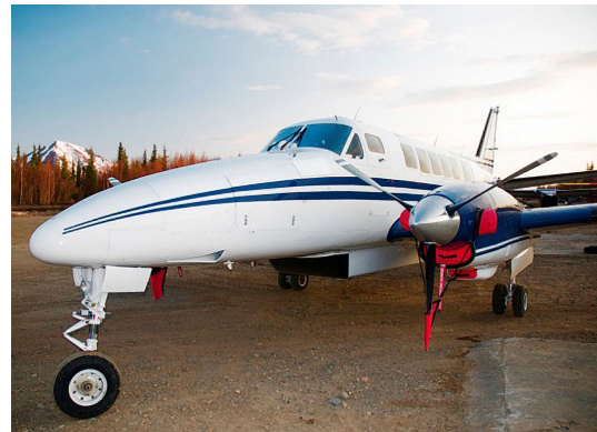
Beech 99 Engine Plugs & Prop Ties