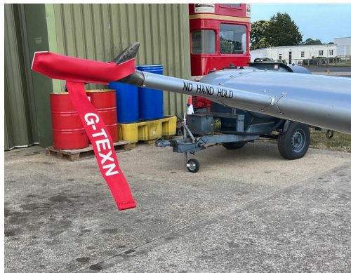
T6 Harvard Pitot Cover, shark fin type

Engine Inlet Plugs are custom fit for your Cessna 190 & 195 intakes, made with heavy-duty vinyl material, and stuffed with a single block of sculpted urethane foam. Each plug has a zipper that allows the foam to be removed and dried if necessary. Engine plugs have warning flags that are visible from the cockpit or 'remove before flight' streamers sewn onto the face of the plugs. Most plugs are imprinted with the aircraft registration number in black for an extra charge. Storage bag NOT included. Engine plugs may be inserted after flight when the engine is still warm. Engine Inlet Plugs are commonly referred to as Cowl Plugs, Intake Plugs, Cowl Blocks, Engine Blocks, and Engine Bungs.