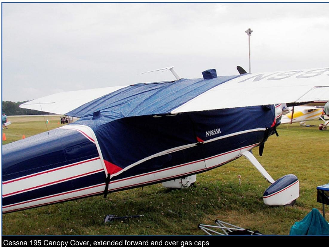
Cessna 195 Canopy Cover, extended forward and over gas caps