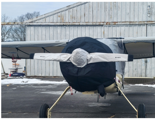
Cessna 190 Travel Canopy, Insulated Engine, Wing & Prop Covers