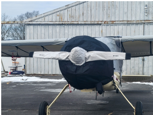
Cessna 190 Travel Canopy, Insulated Engine, Wing & Prop Covers