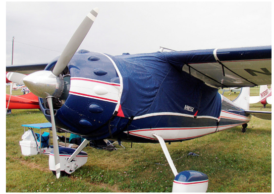
Cessna 195 Canopy Cover, extended forward and over gas caps