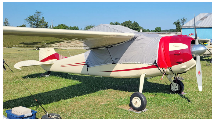
Cessna 190 Travel Cover, Light Weight Canopy Cover, Over-Top Type