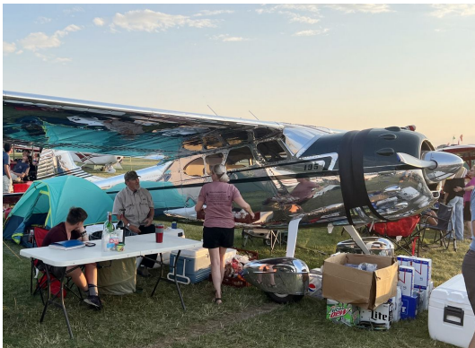
Cessna 190 & 195 Engine Cowl Ring Gap Cover, Open Bottom

This cover type is made from Silver Acrylic Sunbrella canvas and is 100% lined with a soft and smooth microfiber. Bruce's Custom Covers developed this material combination especially for aircraft protection. The outer material is medium weight and treated for water resistance, UV resistance and anti-static buildup. The inner lining is a very soft and smooth microfiber to prevent scratching. The material is very reflective, and tests show that the cabin interior temperature can be reduced to near-ambient temperature on the hottest of days. It is water, ice and snow repellent, yet breathable to allow moisture to escape from between the cover and the aircraft surface.