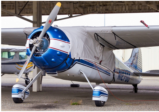
Cessna 195 CANOPY COVER, over-top, 24" fwd ext to cover cowl ring gap, gas cap ext.