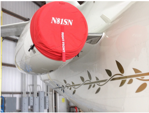
Falcon 900EX Intake Cover