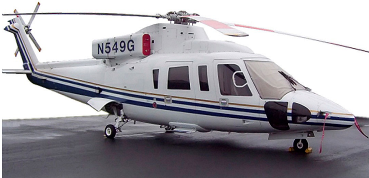
Snap-On Cockpit Cover

This cover type is made from Silver Acrylic Sunbrella canvas and is 100% lined with a soft and smooth microfiber. Bruce's Custom Covers developed this material combination especially for aircraft protection. The outer material is medium weight and treated for water resistance, UV resistance and anti-static buildup. The inner lining is a very soft and smooth microfiber to prevent scratching. The material is very reflective, and tests show that the cabin interior temperature can be reduced to near-ambient temperature on the hottest of days. It is water, ice and snow repellent, yet breathable to allow moisture to escape from between the cover and the aircraft surface.