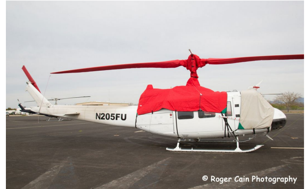
Bell 205 Engine, Rotor Mast, Blades & Forward Cabin Covers