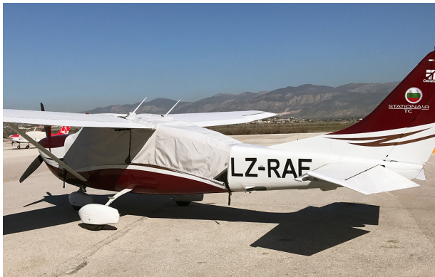
Cessna 206 Stationair Canopy Cover, Over-Top Style

Travel Covers are made with Silver Solution-Dyed Polyester fabric and only lined over the windshield to save weight. The material is lightweight and more compact for easy stowage in the aircraft. The polyester material is water resistant, but only intended for occasional use outside. We also have an ultra lightweight material available for fitted hangar dust covers. For daily outdoor use, the non-travel Sunbrella Cover is the best choice.