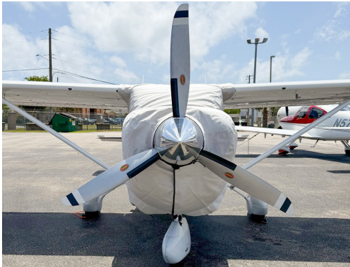
Cessna T206H Engine Cover (also covers bottom)