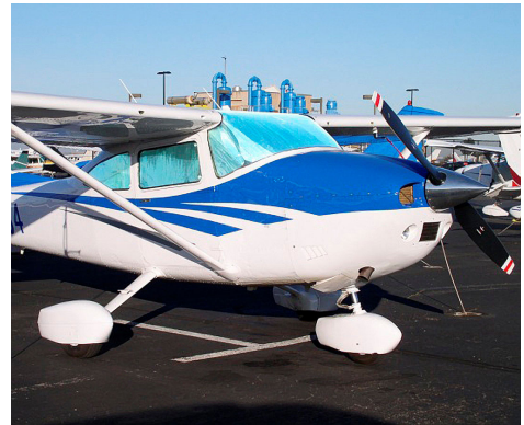
Cessna 182 HeatShield Set