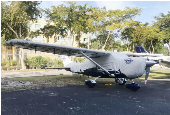
Cessna T206H Canopy, Engine, Wing & Empennage Covers

WINTER USE MATERIAL - Made with Solution-Dyed Polyester fabric, this option is intended for seasonal use to aid in deicing, rain mitigation, or for occasional travel. The material is lighter and more compact, but more susceptible to UV damage and may have a shorter useful life if used continuously outside than the all-year use material.