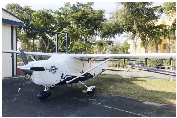
Cessna T206H Canopy, Engine, Wing & Empennage Covers