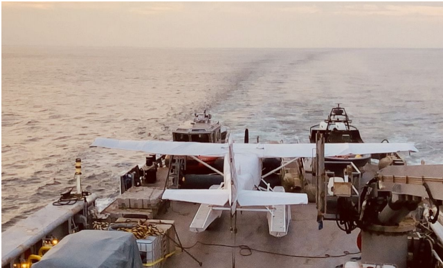
Cessna U206F Amphib Cover Set

This cover type is made from Silver Acrylic Sunbrella canvas and is 100% lined with a soft and smooth microfiber. Bruce's Custom Covers developed this material combination especially for aircraft protection. The outer material is medium weight and treated for water resistance, UV resistance and anti-static buildup. The inner lining is a very soft and smooth microfiber to prevent scratching. The material is very reflective, and tests show that the cabin interior temperature can be reduced to near-ambient temperature on the hottest of days. It is water, ice and snow repellent, yet breathable to allow moisture to escape from between the cover and the aircraft surface.