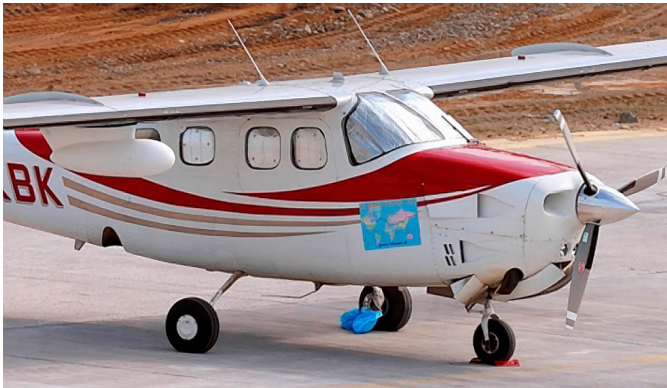
Cessna P210 HeatShield Set

Windshield Heatshields are interior sunshades for an aircraft's front windshield. The product is a unique composite of closed-cell foam with a silver mylar finish. The semi-rigid design is stiff enough to stand along the inside of the windshield using sun visors or window framing. It folds up flat and easily stores in the included storage sleeve. Some designs may require velcro and suction cups or split right and left sides. A Heatshield is an excellent short-term remedy for cockpit overheating. An external fabric cover is far more effective and practical for long-term protection.