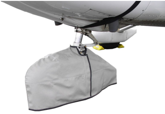
Cessna 172 Nose Gear Fairing Cover