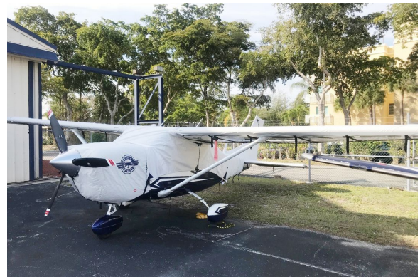
Cessna T206H Canopy, Engine, Wing & Empennage Covers