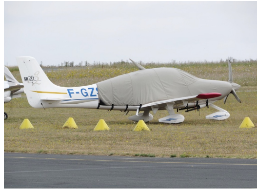
Cirrus SR-22 Extended Canopy/Engine Cover, Prop Cover, Wingtip Pads