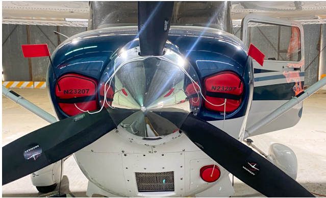
Cessna 206 Engine Inlet Plugs