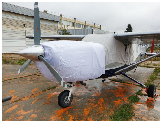
Cessna 207 Engine Cover (test fit)

This cover type is made from Silver Acrylic Sunbrella canvas and is 100% lined with a soft and smooth microfiber. Bruce's Custom Covers developed this material combination especially for aircraft protection. The outer material is medium weight and treated for water resistance, UV resistance and anti-static buildup. The inner lining is a very soft and smooth microfiber to prevent scratching. The material is very reflective, and tests show that the cabin interior temperature can be reduced to near-ambient temperature on the hottest of days. It is water, ice and snow repellent, yet breathable to allow moisture to escape from between the cover and the aircraft surface.