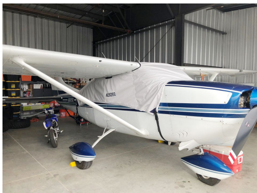
Cessna 206 Wrap-Around Canopy Cover

This cover type is made from Silver Acrylic Sunbrella canvas and is 100% lined with a soft and smooth microfiber. Bruce's Custom Covers developed this material combination especially for aircraft protection. The outer material is medium weight and treated for water resistance, UV resistance and anti-static buildup. The inner lining is a very soft and smooth microfiber to prevent scratching. The material is very reflective, and tests show that the cabin interior temperature can be reduced to near-ambient temperature on the hottest of days. It is water, ice and snow repellent, yet breathable to allow moisture to escape from between the cover and the aircraft surface.