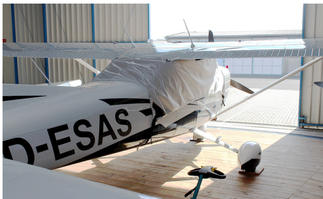
Cessna 206 Stationair Canopy Cover, Wrap-Around