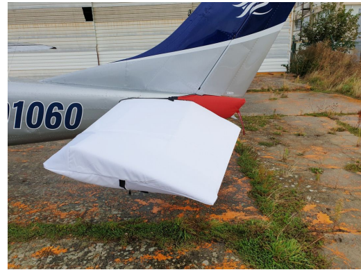
Cessna 207 Tailcone Cover, Horizontal Stab. Cover (test fit)