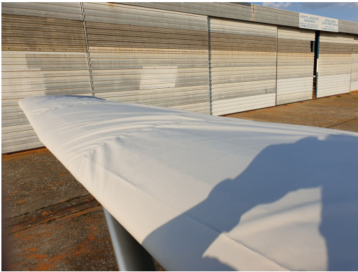
Cessna 207 Wing Covers

WINTER USE MATERIAL - Made with Solution-Dyed Polyester fabric, this option is intended for seasonal use to aid in deicing, rain mitigation, or for occasional travel. The material is lighter and more compact, but more susceptible to UV damage and may have a shorter useful life if used continuously outside than the all-year use material.