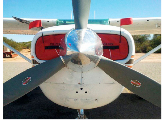
Cessna 207 Engine Inlet Plugs