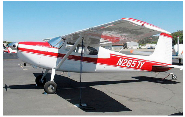
Cessna 180 & 185 Windshield HeatShield