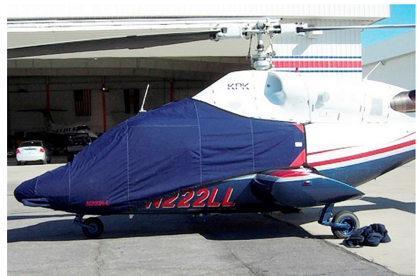
Bell 222 Bubble Cover