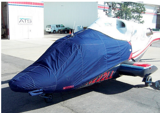
Bell 222 Bubble Cover

This cover type is made from Silver Acrylic Sunbrella canvas and is 100% lined with a soft and smooth microfiber. Bruce's Custom Covers developed this material combination especially for aircraft protection. The outer material is medium weight and treated for water resistance, UV resistance and anti-static buildup. The inner lining is a very soft and smooth microfiber to prevent scratching. The material is very reflective, and tests show that the cabin interior temperature can be reduced to near-ambient temperature on the hottest of days. It is water, ice and snow repellent, yet breathable to allow moisture to escape from between the cover and the aircraft surface.