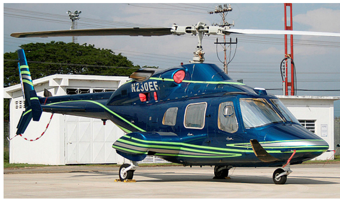
Bell 230 Engine Plugs, HeatShields