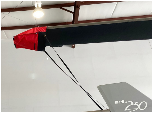
Bell 230 Blade Tie-Downs, (Semi-Rigid) W/Telescoping Attachment Handle