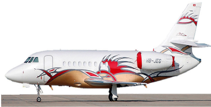
Falcon 2000EX Engine Cover Set, OEM Design

The Falcon Jet 2000EX, 2000LXS Intake Covers are designed to install easily yet be completely storable. A spring steel hoop is sewn into the hem of each cover, allowing them to be installed without climbing onto the wing or using a stepladder. To store the covers the spring steel hoop folds like a band-saw blade into three nesting rings. Each cover folds into a compact circular bundle which is stored in the included duffle bag, yet they unfold quickly for use. The Tri-Fold Ring cover is made of medium weight nylon which is available in a variety of colors to match the paint trim. Each cover set comes complete with installation and folding instructions. The aircraft's registration number can be silkscreened onto the cover for an extra charge.