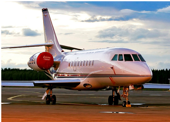
Falcon 2000EX Engine Covers, OEM type

The Falcon Jet 2000EX, 2000LXS Intake Covers are designed to install easily yet be completely storable. A spring steel hoop is sewn into the hem of each cover, allowing them to be installed without climbing onto the wing or using a stepladder. To store the covers the spring steel hoop folds like a band-saw blade into three nesting rings. Each cover folds into a compact circular bundle which is stored in the included duffle bag, yet they unfold quickly for use. The Tri-Fold Ring cover is made of medium weight nylon which is available in a variety of colors to match the paint trim. Each cover set comes complete with installation and folding instructions. The aircraft's registration number can be silkscreened onto the cover for an extra charge.