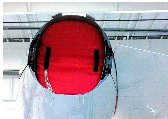
Falcon 2000EX Exhaust Plug