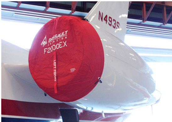
Intake Covers, OEM type (p/n 2KEX-101)