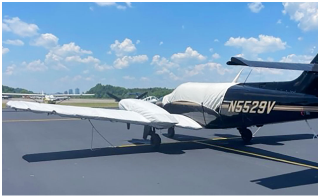
Cessna T303 Crusader Canopy Cover

This cover type is made from Silver Acrylic Sunbrella canvas and is 100% lined with a soft and smooth microfiber. Bruce's Custom Covers developed this material combination especially for aircraft protection. The outer material is medium weight and treated for water resistance, UV resistance and anti-static buildup. The inner lining is a very soft and smooth microfiber to prevent scratching. The material is very reflective, and tests show that the cabin interior temperature can be reduced to near-ambient temperature on the hottest of days. It is water, ice and snow repellent, yet breathable to allow moisture to escape from between the cover and the aircraft surface.