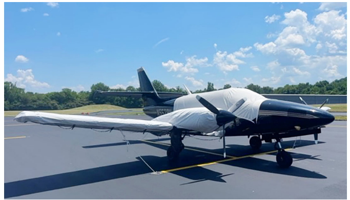
Cessna T303 Crusader Canopy Cover