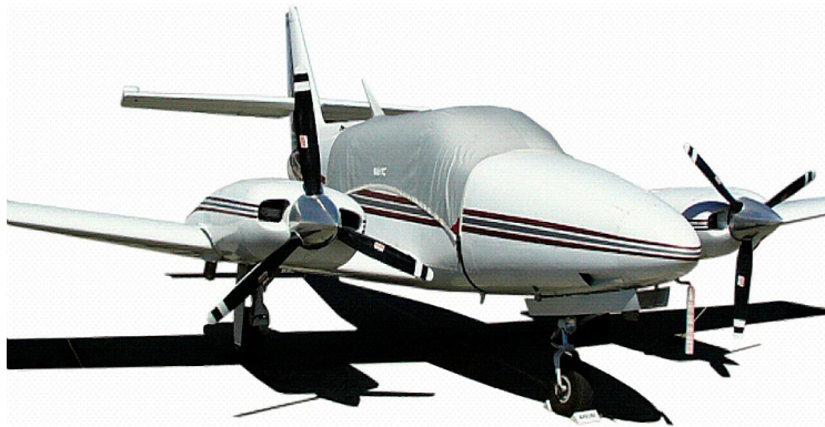
Cessna Crusader Standard Canopy Cover

Travel Covers are made with Silver Solution-Dyed Polyester fabric and only lined over the windshield to save weight. The material is lightweight and more compact for easy stowage in the aircraft. The polyester material is water resistant, but only intended for occasional use outside. We also have an ultra lightweight material available for fitted hangar dust covers. For daily outdoor use, the non-travel Sunbrella Cover is the best choice.