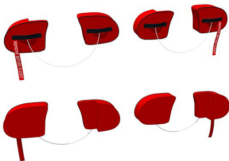
Cessna 414A Engine Plugs

Engine Inlet Plugs are custom fit for your Cessna 320 intakes, made with heavy-duty vinyl material, and stuffed with a single block of sculpted urethane foam. Each plug has a zipper that allows the foam to be removed and dried if necessary. Engine plugs have warning flags that are visible from the cockpit or 'remove before flight' streamers sewn onto the face of the plugs. Most plugs are imprinted with the aircraft registration number in black for an extra charge. Storage bag NOT included. Engine plugs may be inserted after flight when the engine is still warm. Engine Inlet Plugs are commonly referred to as Cowl Plugs, Intake Plugs, Cowl Blocks, Engine Blocks, and Engine Bungs.