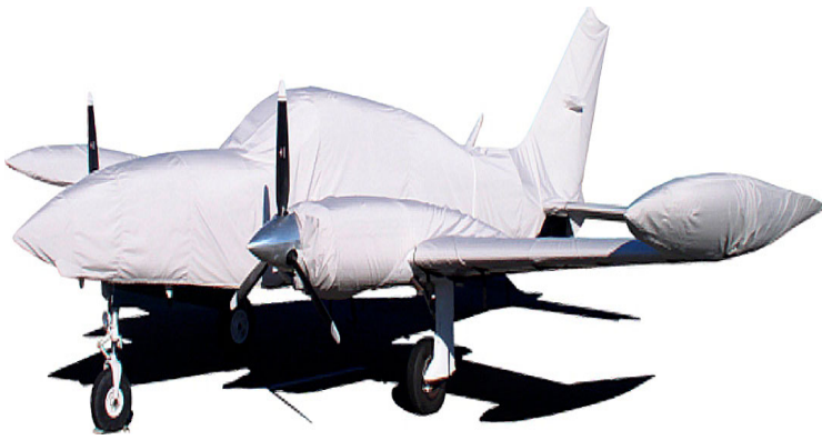
Cessna 310 Complete Cover Set