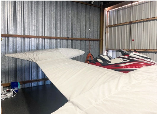
Cessna 335, 340 Empennage Cover (Tailboom, Vertical & Horiz Stabilizers), All Year Use

WINTER USE MATERIAL - Made with Solution-Dyed Polyester fabric, this option is intended for seasonal use to aid in deicing, rain mitigation, or for occasional travel. The material is lighter and more compact, but more susceptible to UV damage and may have a shorter useful life if used continuously outside than the all-year use material.