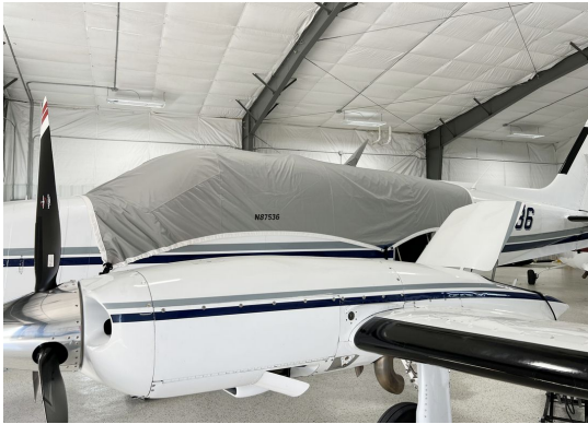
Cessna 340A Travel Weight Canopy Cover

Travel Covers are made with Silver Solution-Dyed Polyester fabric and only lined over the windshield to save weight. The material is lightweight and more compact for easy stowage in the aircraft. The polyester material is water resistant, but only intended for occasional use outside. We also have an ultra lightweight material available for fitted hangar dust covers. For daily outdoor use, the non-travel Sunbrella Cover is the best choice.