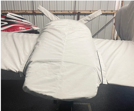
Cessna 335, 340 Empennage Cover (Tailboom, Vertical & Horiz Stabilizers), All Year Use