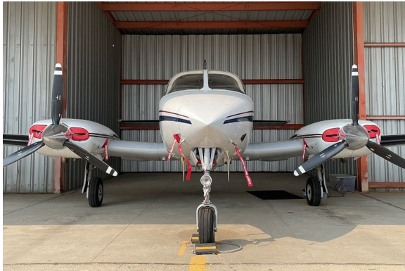
Cessna 340 Engine Plugs, Pitot Covers

Engine Inlet Plugs are custom fit for your Cessna 335, 340 intakes, made with heavy-duty vinyl material, and stuffed with a single block of sculpted urethane foam. Each plug has a zipper that allows the foam to be removed and dried if necessary. Engine plugs have warning flags that are visible from the cockpit or 'remove before flight' streamers sewn onto the face of the plugs. Most plugs are imprinted with the aircraft registration number in black for an extra charge. Storage bag NOT included. Engine plugs may be inserted after flight when the engine is still warm. Engine Inlet Plugs are commonly referred to as Cowl Plugs, Intake Plugs, Cowl Blocks, Engine Blocks, and Engine Bunges.