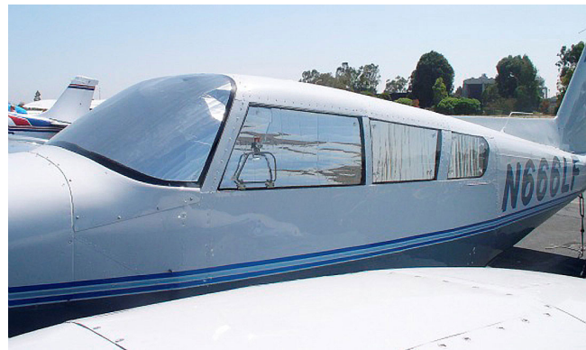
Piper PA-30 Twin Comanche Cockpit HeatShields