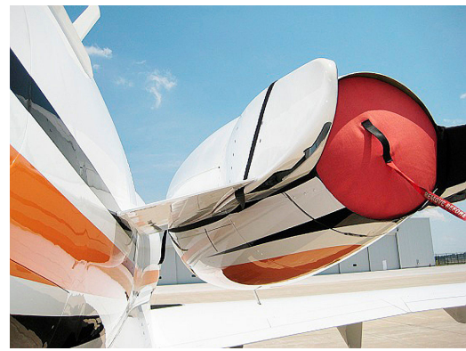
Hawker 4000 Exhaust Plug