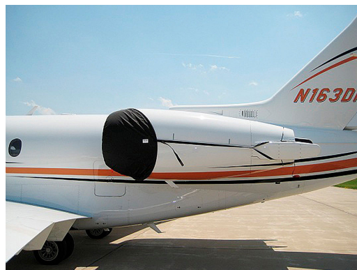
Hawker 4000 Intake Cover