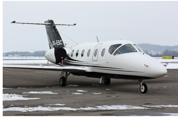
Nextant 400XTi Bikini Type Engine Covers