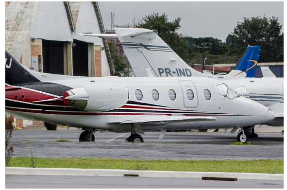
Beechjet Engine Plugs and Cockpit Heatshields