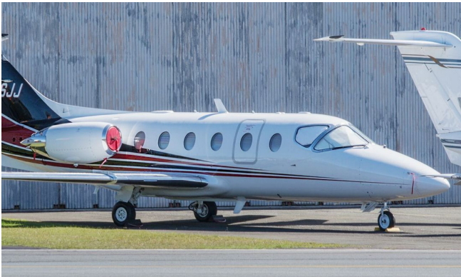
Beechjet Engine Plugs and Cockpit Heatshields