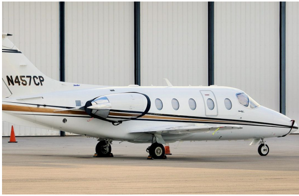
Beechjet 400 Engine Covers, Bikini Type