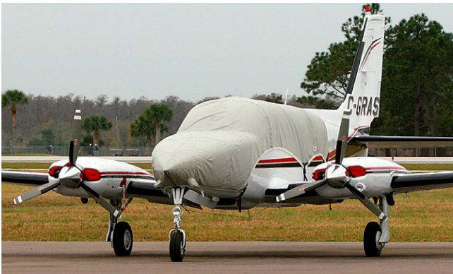
Cessna 340 Canopy/Nose Cover & Engine Inlet Plugs