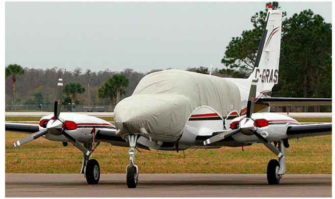
Cessna 340 Canopy/Nose Cover & Engine Inlet Plugs