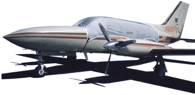
Cessna 421 Cockpit/Windshield Cover