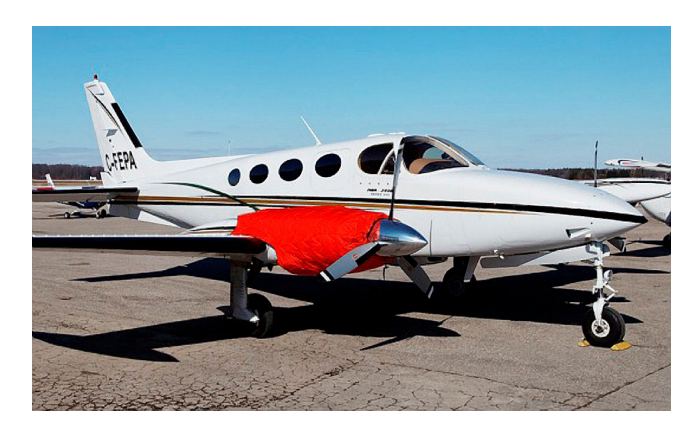
Cessna 340 Insulated Engine Covers

This cover type is made from Silver Acrylic Sunbrella canvas and is 100% lined with a soft and smooth microfiber. Bruce's Custom Covers developed this material combination especially for aircraft protection. The outer material is medium weight and treated for water resistance, UV resistance and anti-static buildup. The inner lining is a very soft and smooth microfiber to prevent scratching. The material is very reflective, and tests show that the cabin interior temperature can be reduced to near-ambient temperature on the hottest of days. It is water, ice and snow repellent, yet breathable to allow moisture to escape from between the cover and the aircraft surface.