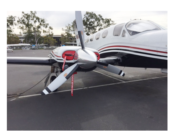
Cessna 414 Engine Inlet Plugs