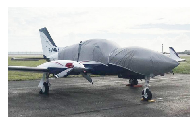
Cessna 414 Travel Cover, Light Weight Canopy Cover

non-travel Sunbrella Cover is the best choice.