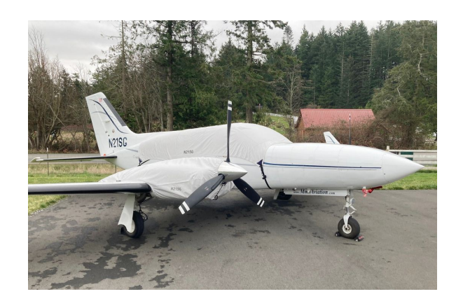
Cessna 421C Canopy & Engine Covers

This cover type is made from Silver Acrylic Sunbrella canvas and is 100% lined with a soft and smooth microfiber. Bruce's Custom Covers developed this material combination especially for aircraft protection. The outer material is medium weight and treated for water resistance, UV resistance and anti-static buildup. The inner lining is a very soft and smooth microfiber to prevent scratching. The material is very reflective, and tests show that the cabin interior temperature can be reduced to near-ambient temperature on the hottest of days. It is water, ice and snow repellent, yet breathable to allow moisture to escape from between the cover and the aircraft surface.