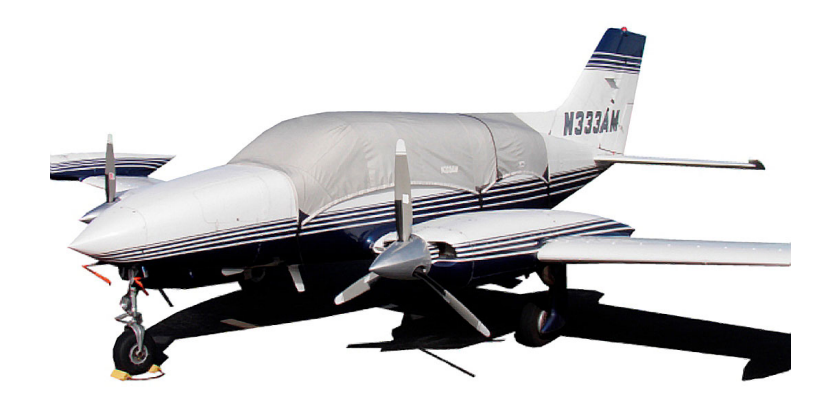
Cessna 414 Canopy Cover & Pitot Covers

This cover type is made from Silver Acrylic Sunbrella canvas and is 100% lined with a soft and smooth microfiber. Bruce's Custom Covers developed this material combination especially for aircraft protection. The outer material is medium weight and treated for water resistance, UV resistance and anti-static buildup. The inner lining is a very soft and smooth microfiber to prevent scratching. The material is very reflective, and tests show that the cabin interior temperature can be reduced to near-ambient temperature on the hottest of days. It is water, ice and snow repellent, yet breathable to allow moisture to escape from between the cover and the aircraft surface.