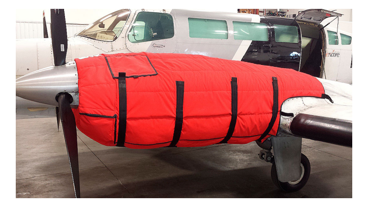
Cessna 404 Insulated Engine Cover