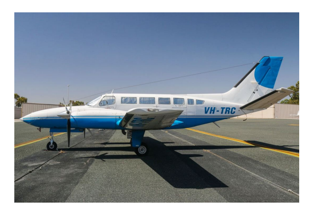
Cessna 404 & F406 HeatShields