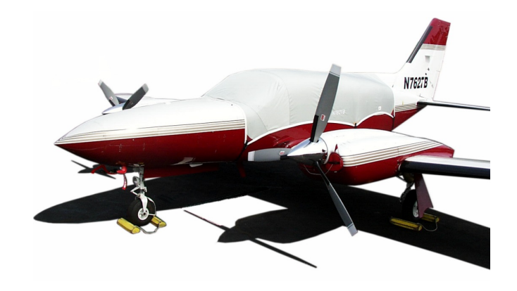
Cessna 421C Canopy Cover & Engine Plugs