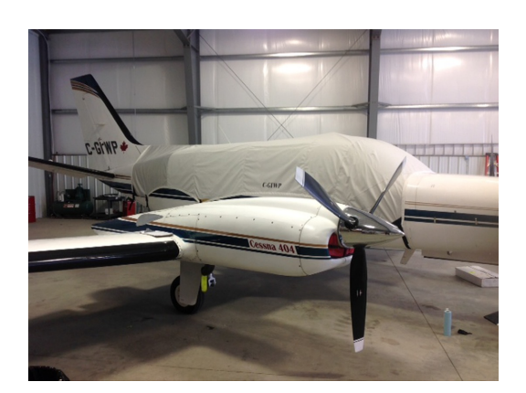
Cessna 404 Canopy Cover, Engine Plugs