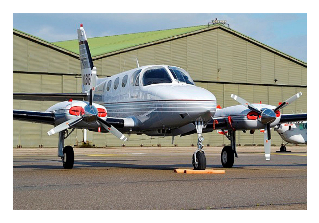
Cessna 340 Engine Plugs

Engine Inlet Plugs are custom fit for your Cessna 404 Titan, F406 Caravan II intakes, made with heavy-duty vinyl material, and stuffed with a single block of sculpted urethane foam. Each plug has a zipper that allows the foam to be removed and dried if necessary. Engine plugs have warning flags that are visible from the cockpit or 'remove before flight' streamers sewn onto the face of the plugs. Most plugs are imprinted with the aircraft registration number in black for an extra charge. Storage bag NOT included. Engine plugs may be inserted after flight when the engine is still warm. Engine Inlet Plugs are commonly referred to as Cowl Plugs, Intake Plugs, Cowl Blocks, Engine Blocks, and Engine Bungs.