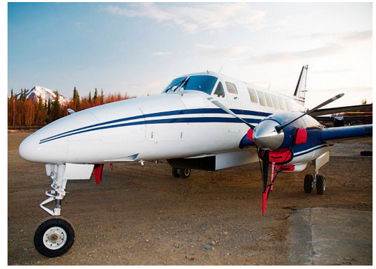
Beech 99 Engine Plugs & Prop Ties