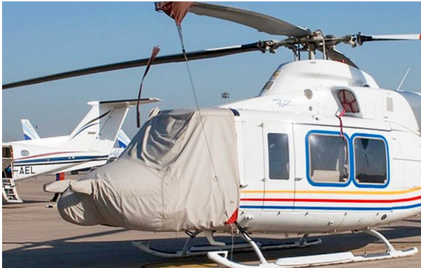
Bell 412 Cockpit/Canopy/Nose Cover, w/Radome

Canopy/Nose Covers enclose the entire canopy including the windshield, skylights, and chin bubble. Attachment buckles are made of nonmetal Delrin , designed for rugged outdoor use. Both the top and bottom hems of the cover have a special rope-hem feature with which they can be tightened to help prevent abrasive chafing of the windshield. Pockets are sewn into the cover for the temperature probe and pitot tubes. The bubble cover is reinforced with patches at hinge points, door handles, and for the windshield wipers. For ease of installation, the bubble cover is color-coded (red=left, green=right) with color swatches sewn into the corners. This cover type is made from Silver Acrylic Sunbrella canvas and is 100% lined with a soft and smooth microfiber. Bruce's Custom Covers developed this material combination especially for aircraft protection. The outer material is medium weight and treated for water resistance, UV resistance and anti-static buildup. The inner lining is a very soft and smooth microfiber to prevent scratching. The material is very reflective, and tests show that the cabin interior temperature can be reduced to near-ambient temperature on the hottest of days. It is water, ice and snow repellent, yet breathable to allow moisture to escape from between the cover and the aircraft surface.