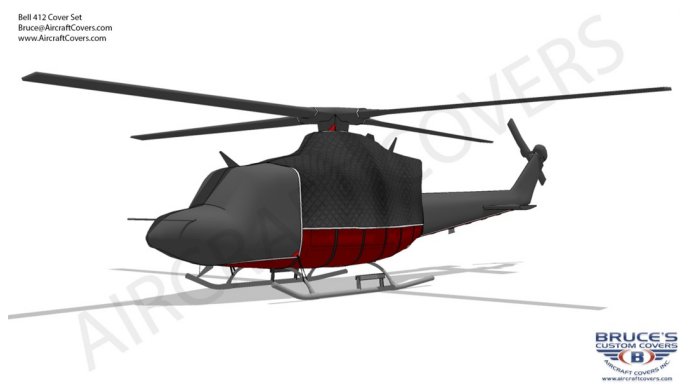
Bell 412 Forward Cabin/Nose, Insulated Engine, Tailboom, Rotor Hub & Blade Covers