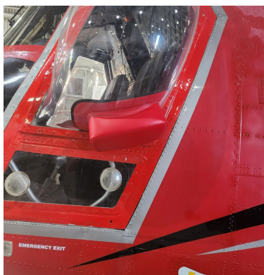
Boeing Vertol CH-47 Logger Window Plug

The Engine Inlet Plugs are custom fit for your Bell 412 intakes, made with heavy-duty vinyl material, and stuffed with a single block of sculpted urethane foam. Each plug has a zipper that allows the foam to be removed and dried if necessary. Engine plugs have 'Remove Before Flight' streamers sewn onto the face of the plugs. Most plugs are imprinted with the aircraft registration number in black for an extra charge. Storage bag NOT included. Engine plugs may be inserted after flight when the engine is still warm. Engine Inlet Plugs are commonly referred to as Cowl Plugs, Intake Plugs, Cowl Blocks, Engine Blocks, and Engine Bungs.