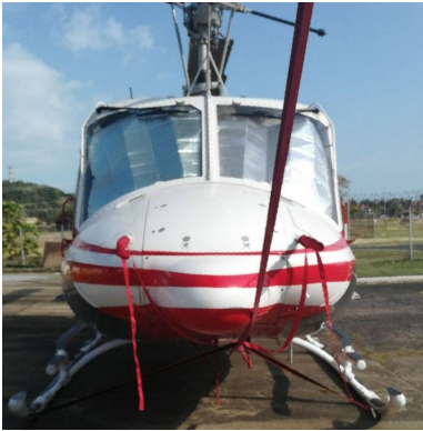
Bell 212 Windshield HeatShields

windows. It folds up flat and easily stores in the included storage sleeve. Some designs may require velcro and suction cups. A Heatshield is an excellent short-term remedy for cockpit overheating. An external fabric canopy is far more effective and practical for long-term protection.