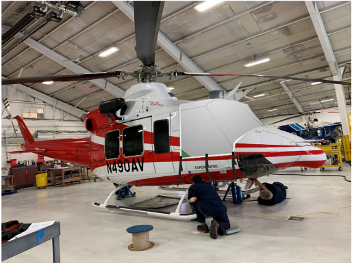
Bell 412 Cockpit/Canopy Cover, photo/illustration

Travel Covers are made with Silver Solution-Dyed Polyester fabric and fully lined over the entire cover. The material is lightweight and more compact for easy stowage in the aircraft. The polyester material is water resistant, but only intended for occasional use outside. We also have an ultra lightweight material available for fitted hangar dust covers. For daily outdoor use, the non-travel Sunbrella Cover is the best choice.