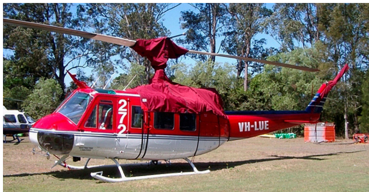
Bell 204/205 Engine/Mid-Cabin Cover, Main & Tail Rotor Covers

WINTER USE MATERIAL - Made with Solution-Dyed Polyester fabric, this option is intended for seasonal use to aid in deicing, rain mitigation, or for occasional travel. The material is lighter and more compact, but more susceptible to UV damage and may have a shorter useful life if used continuously outside than the all-year use material.