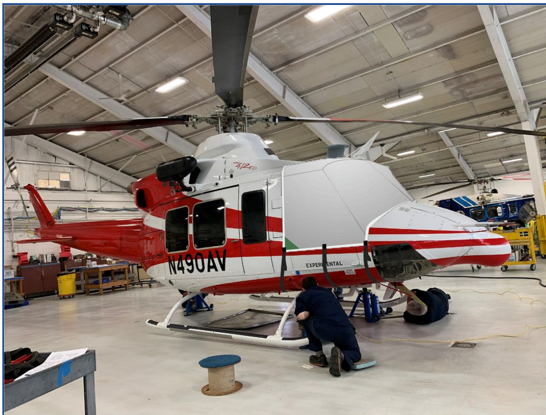
Bell 412 Cockpit/Canopy Cover, photo/illustration