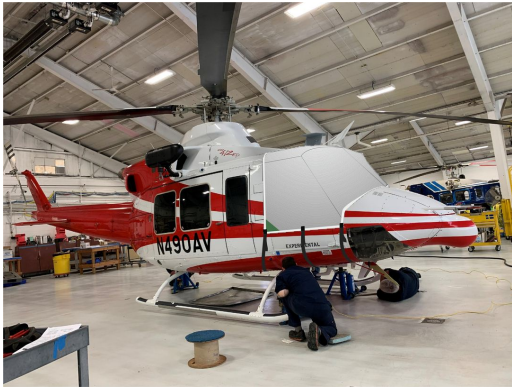
Bell 412 Cockpit/Canopy Cover, photo/illustration