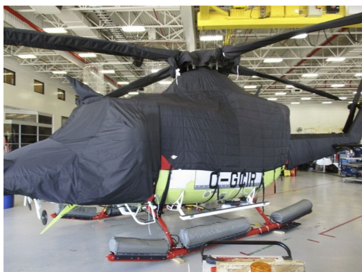
Bell 412 Cockpit/Canopy/Nose, Insulated Engine Area, Rotor Hub, Blade, Tailboom and Tail Rotor Covers

The Tailboom Cover details vary by model, but generally the helicopter tail boom cover encloses the tail boom from the "bottleneck" to the aft end. They usually also cover the horizontal stabilizers, and are custom made to allow for antennae, lights, and other protrusions. They attach with straps underneath the tail boom. Covers for the vertical and horizontal stabilizers are also available separately. Specific information for each model is available on request.