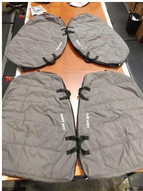
MD 500D Padded Door Bags

**Padded Door Bags* are designed to provide portable protection of the doors when they are removed from the aircraft. They are padded to moderate thickness, zippered closed, and have sturdy carry handles for easy transport.