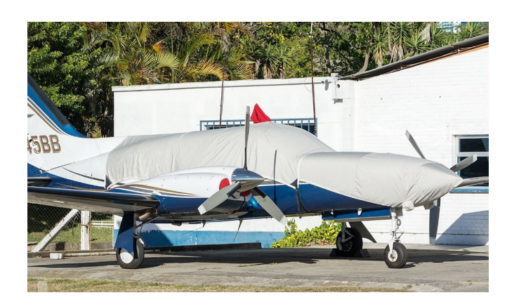
Cessna 421 Canopy Cover & Nose Cover