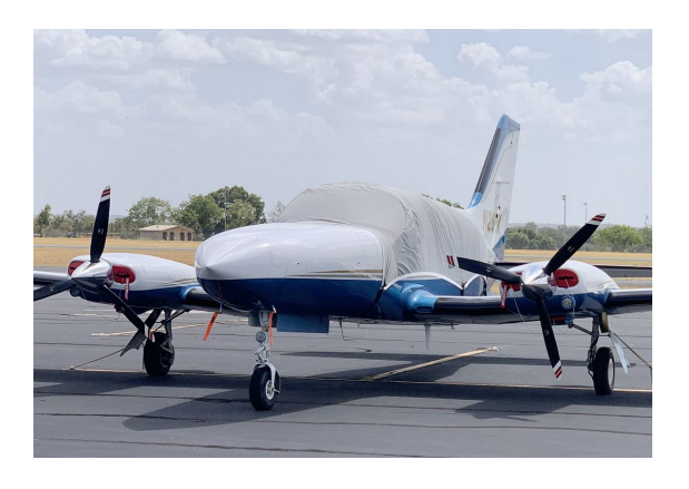
Cessna 414 Travel Weight Canopy Cover, Engine Plugs