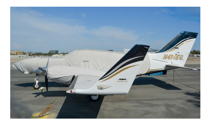
Cessna 414A Extended Canopy/Nose Cover & Engine Covers

This cover type is made from Silver Acrylic Sunbrella canvas and is 100% lined with a soft and smooth microfiber. Bruce's Custom Covers developed this material combination especially for aircraft protection. The outer material is medium weight and treated for water resistance, UV resistance and anti-static buildup. The inner lining is a very soft and smooth microfiber to prevent scratching. The material is very reflective, and tests show that the cabin interior temperature can be reduced to near-ambient temperature on the hottest of days. It is water, ice and snow repellent, yet breathable to allow moisture to escape from between the cover and the aircraft surface.