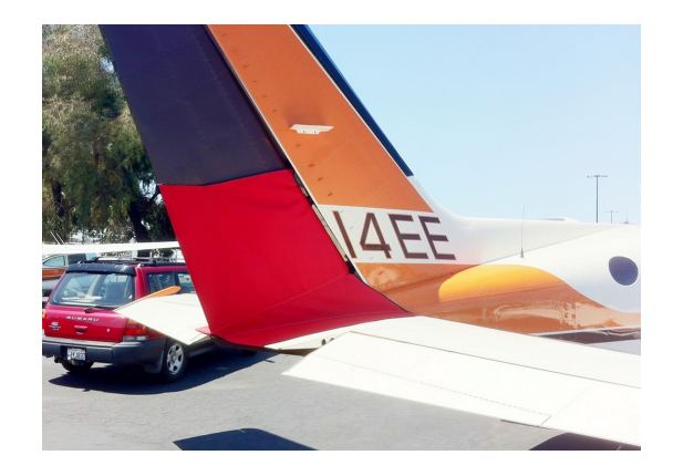
Cessna 414 Rudder Openings Cover (bird barrier)