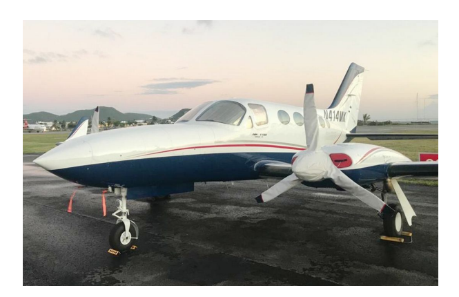
Cessna 414 Propellor/Spinner Covers, 3 Blade

Heatshields are interior sunshades for an aircraft's windows or canopy glass. The product is a unique composite of closed-cell foam with a silver mylar finish. The semi-rigid design is stiff enough to stand along the inside of the windshield using sun visors or window framing. It folds up flat and easily stores in the included storage sleeve. Some designs may require velcro and suction cups. A Heatshield is an excellent short-term remedy for cockpit overheating.