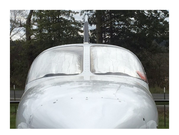
Cessna 421 Windshield HeatShields