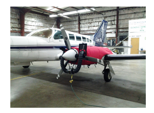
Cessna 402 Insulated Engine Cover with Heater

This cover type is made from Silver Acrylic Sunbrella canvas and is 100% lined with a soft and smooth microfiber. Bruce's Custom Covers developed this material combination especially for aircraft protection. The outer material is medium weight and treated for water resistance, UV resistance and anti-static buildup. The inner lining is a very soft and smooth microfiber to prevent scratching. The material is very reflective, and tests show that the cabin interior temperature can be reduced to near-ambient temperature on the hottest of days. It is water, ice and snow repellent, yet breathable to allow moisture to escape from between the cover and the aircraft surface.