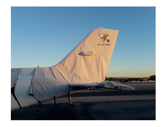
Cessna 421 Empennage Cover

WINTER USE MATERIAL - Made with Solution-Dyed Polyester fabric, this option is intended for seasonal use to aid in deicing, rain mitigation, or for occasional travel. The material is lighter and more compact, but more susceptible to UV damage and may have a shorter useful life if used continuously outside than the all-year use material.