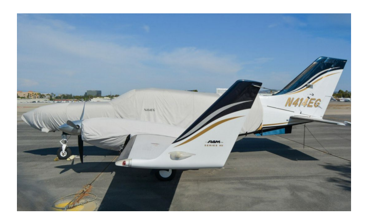
Cessna 414A Extended Canopy/Nose Cover & Engine Covers