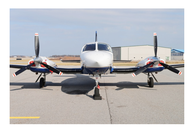
Cessna 421C Engine Inlet Plugs

Engine Inlet Plugs are custom fit for your Cessna 414, 414A intakes, made with heavy-duty vinyl material, and stuffed with a single block of sculpted urethane foam. Each plug has a zipper that allows the foam to be removed and dried if necessary. Engine plugs have warning flags that are visible from the cockpit or 'remove before flight' streamers sewn onto the face of the plugs. Most plugs are imprinted with the aircraft registration number in black for an extra charge. Storage bag NOT included. Engine plugs may be inserted after flight when the engine is still warm. Engine Inlet Plugs are commonly referred to as Cowl Plugs, Intake Plugs, Cowl Blocks, Engine Blocks, and Engine Bungs.