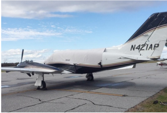
Cessna 421 Canopy Cover

Covers developed this material combination especially for aircraft protection. The outer material is medium weight and treated for water resistance, UV resistance and anti-static buildup. The inner lining is a very soft and smooth microfiber to prevent scratching. The material is very reflective, and tests show that the cabin interior temperature can be reduced to near-ambient temperature on the hottest of days. It is water, ice and snow repellent, yet breathable to allow moisture to escape from between the cover and the aircraft surface.