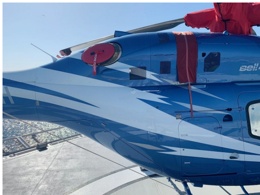
Bell 429 Exhaust Plug, Rotor Mast Cover

WINTER USE MATERIAL - Made with Solution-Dyed Polyester fabric, this option is intended for seasonal use to aid in deicing, rain mitigation, or for occasional travel. The material is lighter and more compact, but more susceptible to UV damage and may have a shorter useful life if used continuously outside than the all-year use material.