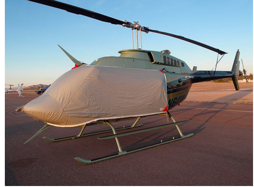
Bell 206L Longranger Bubble Cover