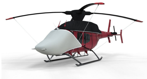
Bell 429 Cockpit/Nose Cover, Engine Cover, etc.