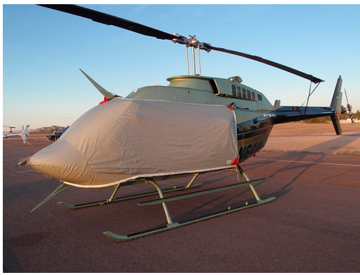
Bell 206L Longranger Bubble Cover