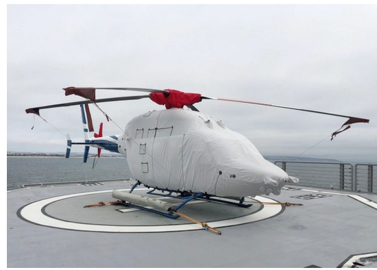
Bell 429 Main Body Cover, Rotor Hub & Tail Rotor Covers