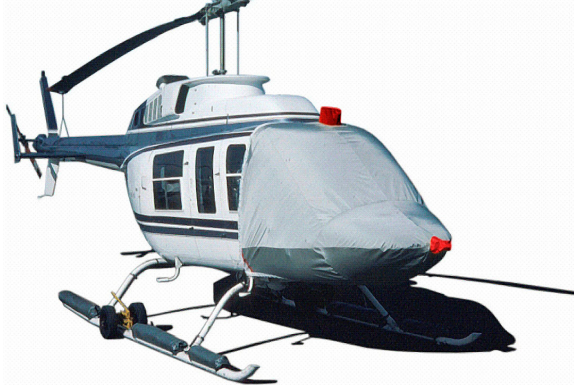
Cockpit Cover on Bell 206L

Travel Covers are made with Silver Solution-Dyed Polyester fabric and fully lined over the entire cover. The material is lightweight and more compact for easy stowage in the aircraft. The polyester material is water resistant, but only intended for occasional use outside. We also have an ultra lightweight material available for fitted hangar dust covers. For daily outdoor use, the non-travel Sunbrella Cover is the best choice.