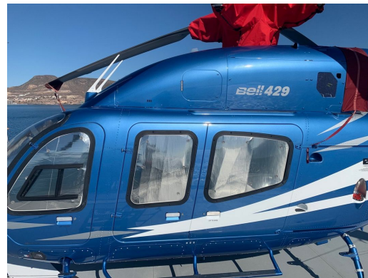
Bell 429 Rotor Hub Cover, Cockpit & Cabin HeatShields Bell 429 Cockpit & Cabin HeatShields, Rotor Mast/Drive Shafts Cover