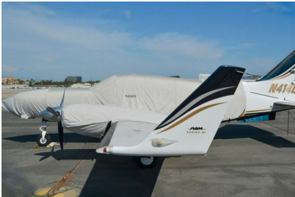
Cessna 414 Extended Canopy/Nose Cover, Engine Covers

Covers developed this material combination especially for aircraft protection. The outer material is medium weight and treated for water resistance, UV resistance and anti-static buildup. The inner lining is a very soft and smooth microfiber to prevent scratching. The material is very reflective, and tests show that the cabin interior temperature can be reduced to near-ambient temperature on the hottest of days. It is water, ice and snow repellent, yet breathable to allow moisture to escape from between the cover and the aircraft surface.