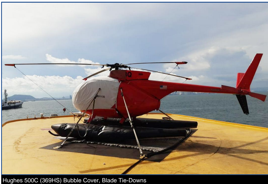
Hughes 500C (369HS) Bubble Cover, Blade Tie-Downs