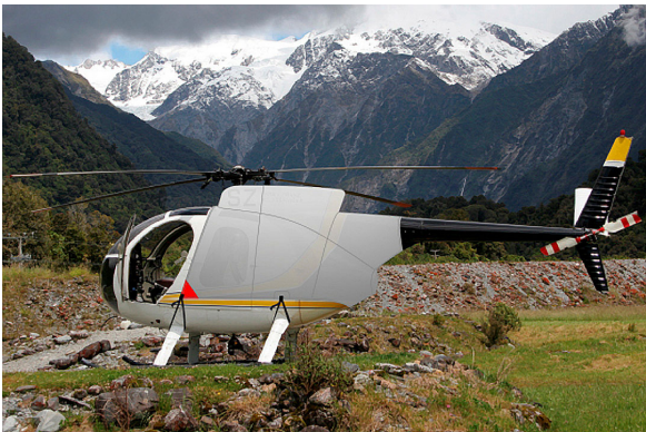
Engine Cover (illustration)