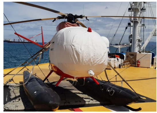
Hughes 500C (369HS) Bubble Cover