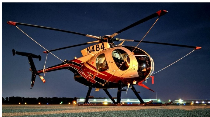
Hughes 500D Blade Tie-Downs

WINTER USE MATERIAL - Made with Solution-Dyed Polyester fabric, this option is intended for seasonal use to aid in deicing, rain mitigation, or for occasional travel. The material is lighter and more compact, but more susceptible to UV damage and may have a shorter useful life if used continuously outside than the all-year use material.