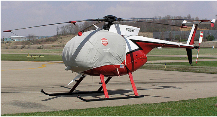
Hughes 500D Bubble Cover with Wire Strike detail and Blade Tie-downs

Travel Covers are made with Silver Solution-Dyed Polyester fabric and fully lined over the entire cover. The material is lightweight and more compact for easy stowage in the aircraft. The polyester material is water resistant, but only intended for occasional use outside. We also have an ultra lightweight material available for fitted hangar dust covers. For daily outdoor use, the non-travel Sunbrella Cover is the best choice.