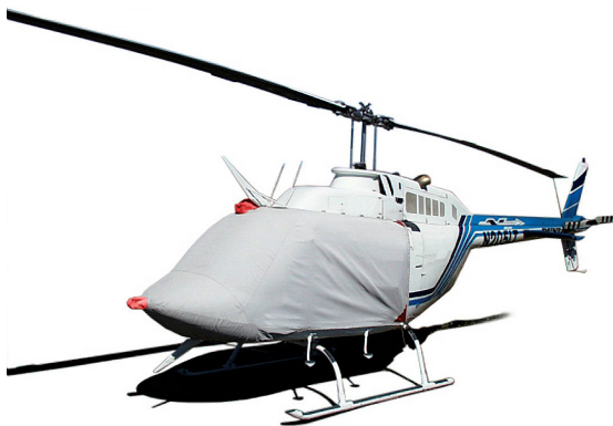
JetRanger Bubble Cover

Travel Covers are made with Silver Solution-Dyed Polyester fabric and fully lined over the entire cover. The material is lightweight and more compact for easy storage in the aircraft. The polyester material is water resistant, but only intended for occasional use outside. We also have an ultra lightweight material available for fitted hangar dust covers. For daily outdoor use, the non-travel Sunbrella Cover is the best choice.