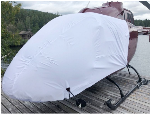
Bell 505 Bubble Cover, test fit cover