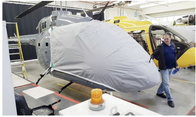
Bell 505 Bubble Cover