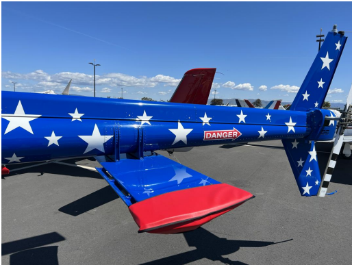
Bell 505 Horizontal Stabilizer Tip Pads

Designed to prevent damage to the aircraft extremities in crowded hangars, these products are made of bright red Naugahyde and thickly padded with a sandwich of closed cell foam.