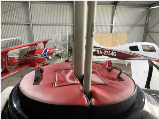
Bell 505 Jet Ranger X Swash Plate Plug

The Engine Inlet Plugs are custom fit for your Bell 505 Jet Ranger X intakes, made with heavy-duty vinyl material, and stuffed with a single block of sculpted urethane foam. Each plug has a zipper that allows the foam to be removed and dried if necessary. Engine plugs have 'Remove Before Flight' streamers sewn onto the face of the plugs. Most plugs are imprinted with the aircraft registration number in black for an extra charge. Storage bag NOT included. Engine plugs may be inserted after flight when the engine is still warm. Engine Inlet Plugs are commonly referred to as Cowl Plugs, Intake Plugs, Cowl Blocks, Engine Blocks, and Engine Bungs.