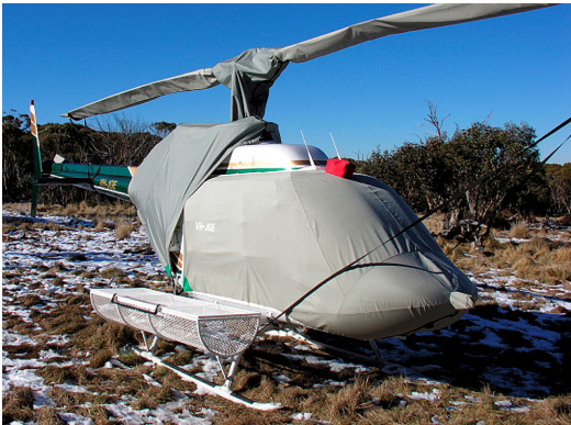
JetRanger Bubble, Engine, Rotor Hub & Blade Covers (& Tie-Downs)