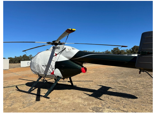
Hughes 500C Bubble Cover with Intake Add-on, Blade Tie-downs