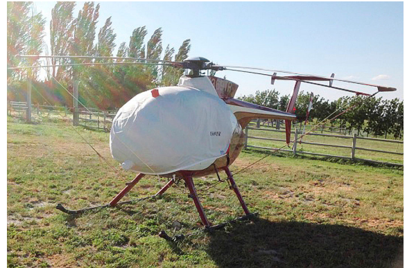
MD500D Bubble Cover with Intake Add-On