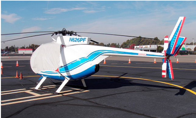
MD500C Bubble Cover with Wire Strike detail

Travel Covers are made with Silver Solution-Dyed Polyester fabric and fully lined over the entire cover. The material is lightweight and more compact for easy stowage in the aircraft. The polyester material is water resistant, but only intended for occasional use outside. We also have an ultra lightweight material available for fitted hangar dust covers. For daily outdoor use, the non-travel Sunbrella Cover is the best choice.