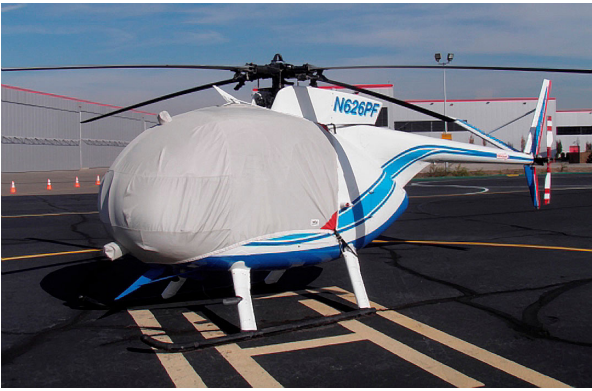
MD500C Bubble Cover with Wire Strike detail