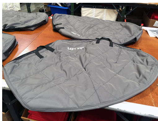
Protective Door Bags