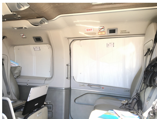
Eurocopter EC-145 Cabin Heatshields