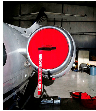
Beechjet 400A Engine Intake Plug with Generator Inlet Plug