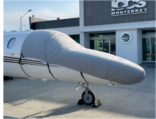
Cessna Citationjet 525B Travel Weight Cockpit/Nose Cover