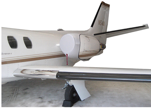
Cessna Citation "Bikini" Type Engine Covers: Extremely Light & Portable