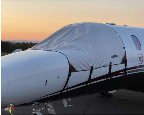
Cessna Citation Jet 525 Cockpit Cover

This cover type is made from Silver Acrylic Sunbrella canvas and is 100% lined with a soft and smooth microfiber. Bruce's Custom Covers developed this material combination especially for aircraft protection. The outer material is medium weight and treated for water resistance, UV resistance and anti-static buildup. The inner lining is a very soft and smooth microfiber to prevent scratching. The material is very reflective, and tests show that the cabin interior temperature can be reduced to near-ambient temperature on the hottest of days. It is water, ice and snow repellent, yet breathable to allow moisture to escape from between the cover and the aircraft surface.