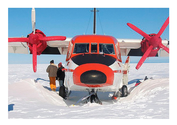
Casa 212 Insulated Engine & Propellor/Spinner Covers

ATR-72-202 Insulated Engine & Prop Hub Covers