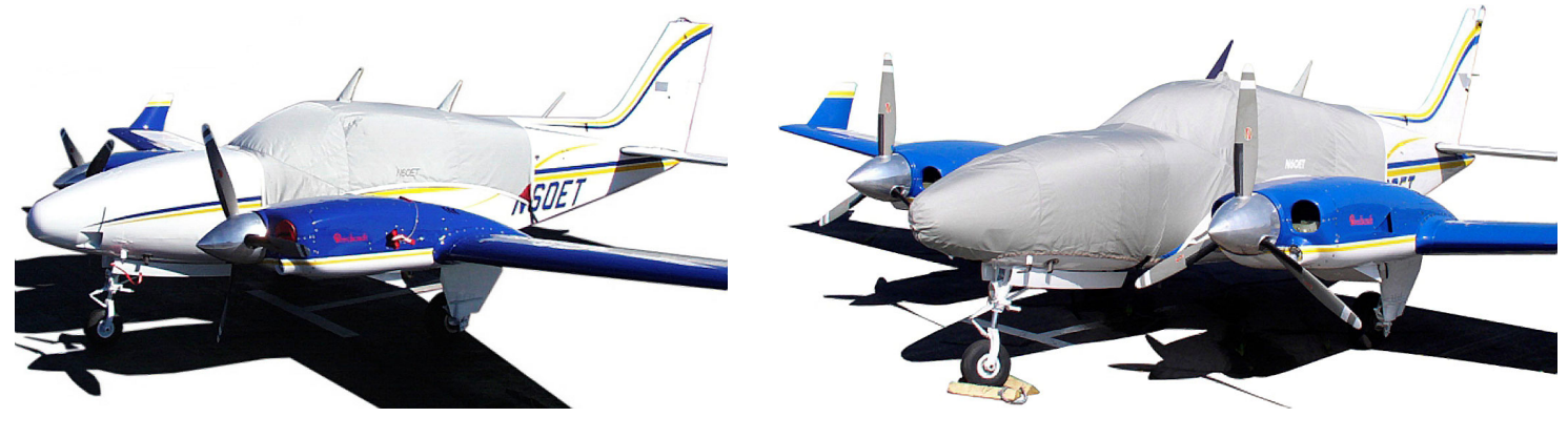
Standard Canopy Cover & Engine Plugs

Travel Covers are made with Silver Solution-Dyed Polyester fabric and only lined over the windshield to save weight. The material is lightweight and more compact for easy stowage in the aircraft. The polyester material is water resistant, but only intended for occasional use outside. We also have an ultra lightweight material available for fitted hangar dust covers. For daily outdoor use, the non-travel Sunbrella Cover is the best choice.