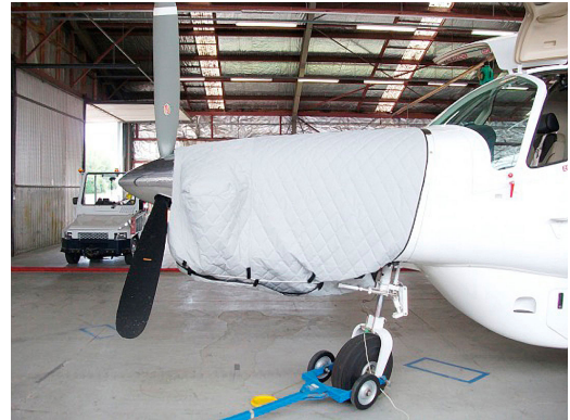
750XL Insulated Engine Cover