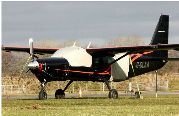
Cessna Caravan Cockpit Cover, Engine Plugs, Jump Door Cover