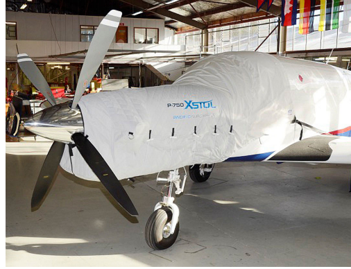
750XL Combination Insulated Engine Cover/Cockpit Cover