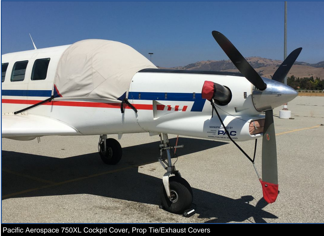
Pacific Aerospace 750XL Cockpit Cover, Prop Tie/Exhaust Covers