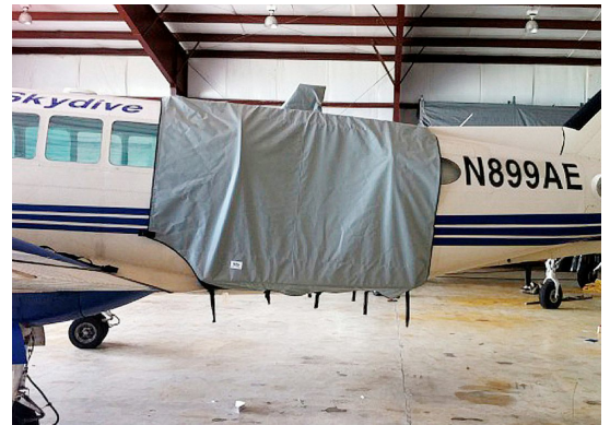
750XL Jump Door Cover