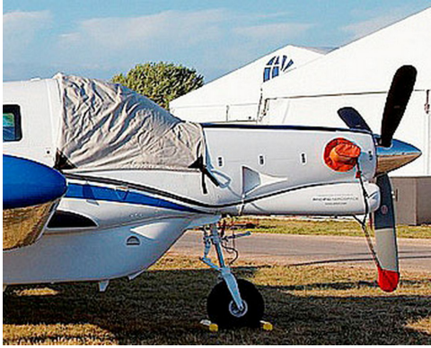
750XL Cockpit Cover & Prop Tie/Exhaust Covers

The material is very reflective, and tests show that the cabin interior temperature can be reduced to near-ambient temperature on the hottest of days. It is water, ice and snow repellent, yet breathable to allow moisture to escape from between the cover and the aircraft surface.