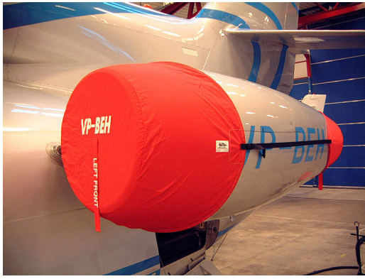
Falcon 900 Engine Covers, outboard & inboard strap detail