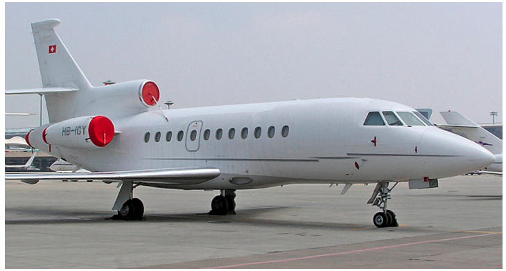
Falcon 900 Engine Covers, hook detail