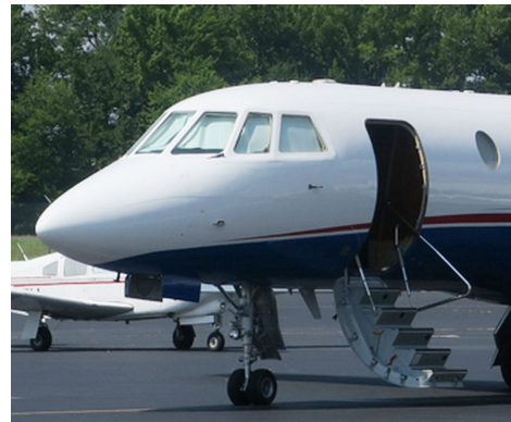
Dassault Falcon 50 Cockpit HeatShields