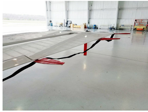
Hawker Beechcraft 800, 800XP, 850XP Static Wick Protectors