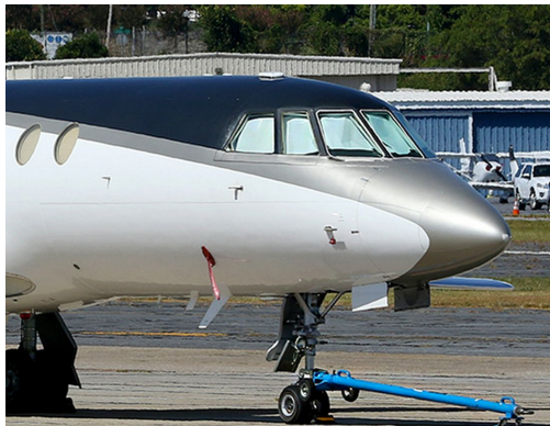
Dassault Falcon 50 Cockpit HeatShields

Cockpit Heatshields are interior sunshades for the aircraft's cockpit. The product is a unique composite of closed-cell foam with a silver mylar finish. The semi-rigid design is stiff enough to stand inside the window framing. The set folds up flat and is easily stored in the included storage sleeve. Some designs may require velcro and suction cups. Our Heatshields for jets are offered white side out because some aircraft manufacturers have issued advisories against reflective window inserts due to potential heat damage. A Heatshield is an excellent short-term remedy for cockpit overheating, but an external fabric cover is more effective for long-term protection.