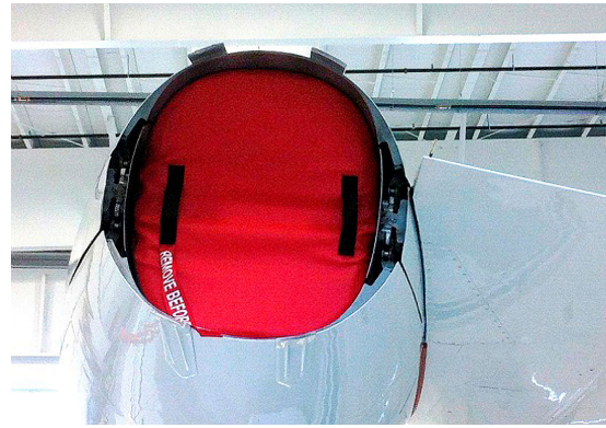
Falcon 2000EX Exhaust Plug