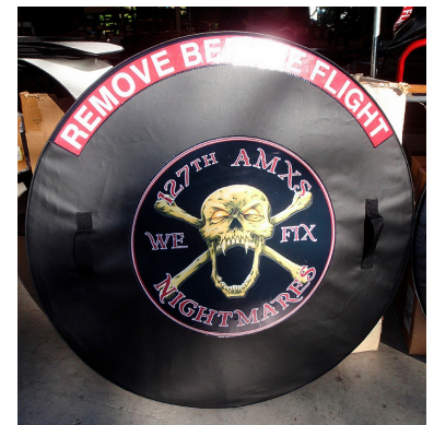
A-10 Engine Intake Plug