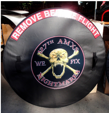
A-10 Engine Intake Plug

The Engine Inlet Plugs are custom fit for your Fairchild A10 Thunderbolt intakes, made with heavy-duty vinyl material, and stuffed with a single block of sculpted urethane foam. Each plug has a zipper that allows the foam to be removed and dried if necessary. Engine plugs have 'remove before flight' streamers sewn onto the face of the plugs. Most plugs are imprinted with the aircraft registration number in black for an extra charge. Storage bag NOT included. Engine plugs may be inserted after flight when the engine is still warm. Engine Inlet Plugs are commonly referred to as Cowl Plugs, Intake Plugs, Cowl Blocks, Engine Blocks, and Engine Bungs.