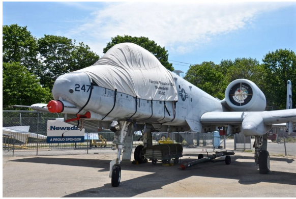
Fairchild A10 Thunderbolt Canopy Cover, Nose Gun Cover, Gun Scoop Inlet Plug