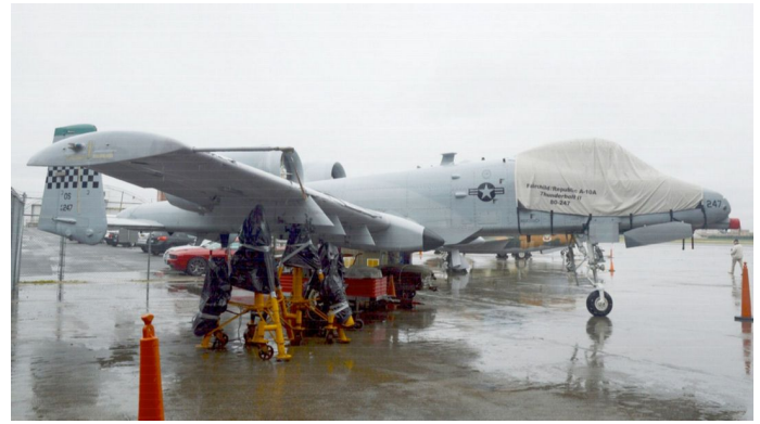
Fairchild A10 Thunderbolt Canopy Cover