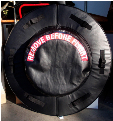
A-10 Exhaust Plug/Cover