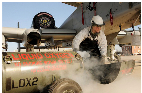
A-10 Engine Intake Cover