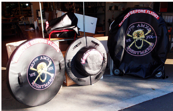
A-10 Engine Intake Plug, Exhaust Plug/Cover, Intake Cover (from left to right)

The Engine Inlet Plugs are custom fit for your Fairchild A10 Thunderbolt intakes, made with heavy-duty vinyl material, and stuffed with a single block of sculpted urethane foam. Each plug has a zipper that allows the foam to be removed and dried if necessary. Engine plugs have 'remove before flight' streamers sewn onto the face of the plugs. Most plugs are imprinted with the aircraft registration number in black for an extra charge. Storage bag NOT included. Engine plugs may be inserted after flight when the engine is still warm. Engine Inlet Plugs are commonly referred to as Cowl Plugs, Intake Plugs, Cowl Blocks, Engine Blocks, and Engine Bungs.