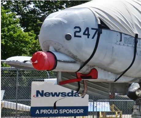
Fairchild A10 Thunderbolt Canopy Cover, Nose Gun Cover, Gun Scoop Inlet Plug Fairchild A10 Thunderbolt Nose Gun Cover, Gun Scoop Inlet Plug