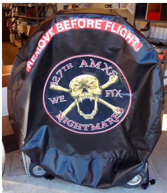
A-10 Engine Intake Cover

ALL-YEAR USE MATERIAL - Made with Solution dyed Polyester fabric, the all-year use material is the best option for sun protection and cover longevity. This heavier more durable material is intended for all weather conditions, such as rain and snow or lots of sun.