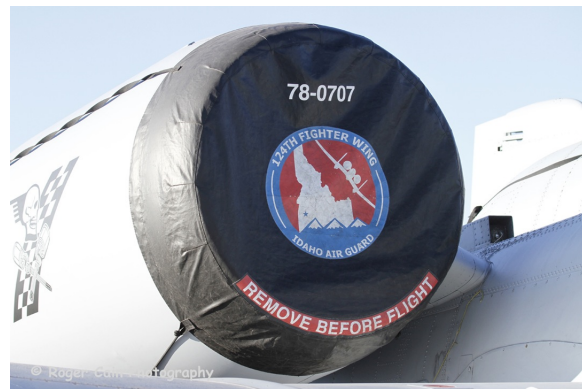
Fairchild A-10 Engine Covers