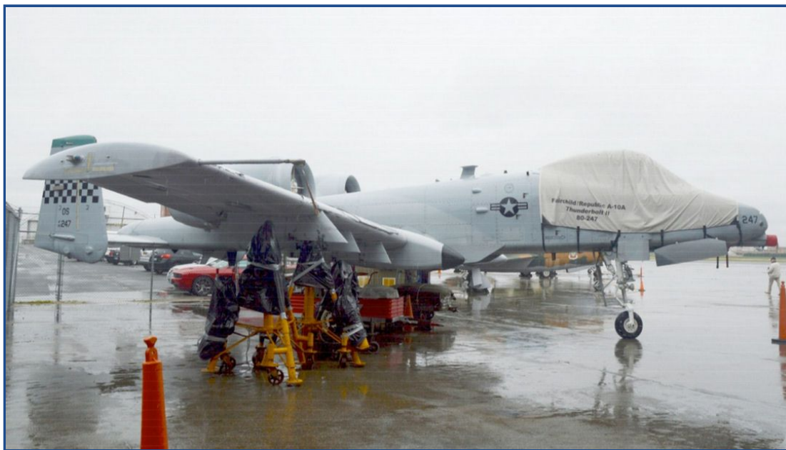
Fairchild A10 Thunderbolt Canopy Cover