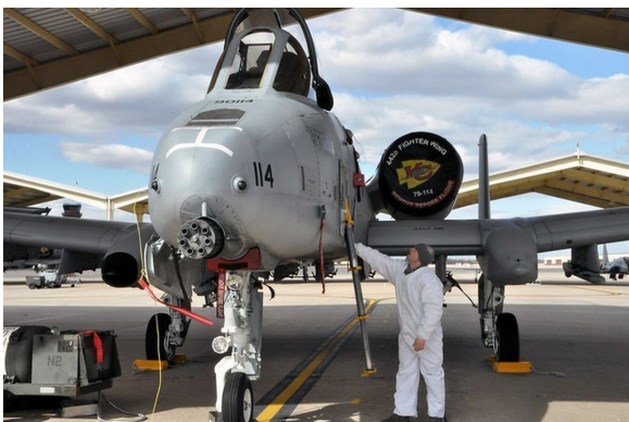
Fairchild A10 Intake Covers & Nose Gun Scoop Plug

ALL-YEAR USE MATERIAL - Made with Solution dyed Polyester fabric, the all-year use material is the best option for sun protection and cover longevity. This heavier more durable material is intended for all weather conditions, such as rain and snow or lots of sun.