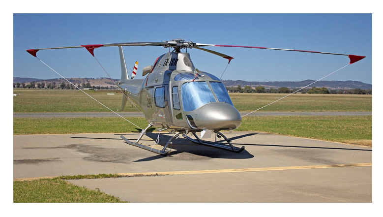
Agusta 119 Cockpit/Cabin HeatShields