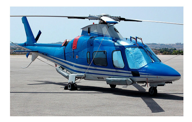
Agusta Power Cockpit HeatShields & Blade Tie-downs