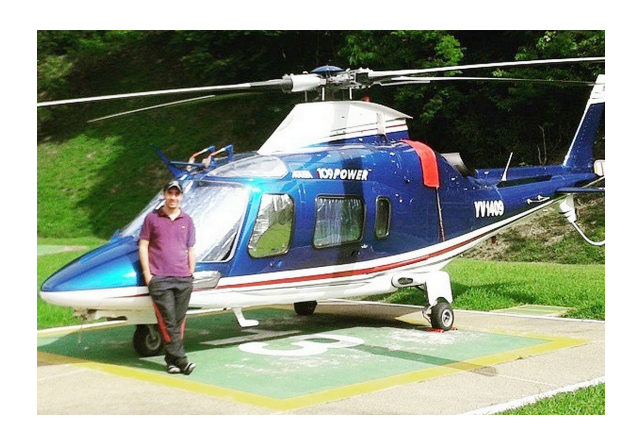
Agusta Power Cockpit & Cabin HeatShields