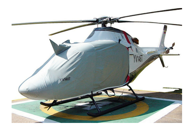
Koala Bubble Cover (with Wire Strike)