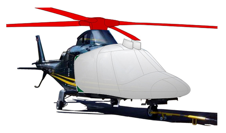
Agusta 109 Bubble, Rotor Hub & Blade Covers (illustration)

Travel Covers are made with Silver Solution-Dyed Polyester fabric and fully lined over the entire cover. The material is lightweight and more compact for easy stowage in the aircraft. The polyester material is water resistant, but only intended for occasional use outside. We also have an ultra lightweight material available for fitted hangar dust covers. For daily outdoor use, the non-travel Sunbrella Cover is the best choice.