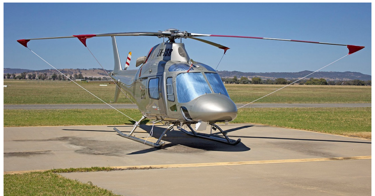
Agusta 119 Cockpit/Cabin HeatShields