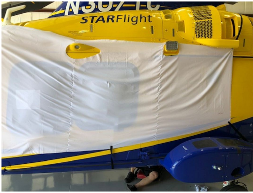
Leonardo (Agusta) A-169 Bubble Cover, test fit cover