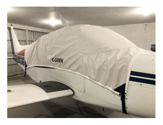
Beech Sierra B24R Canopy Cover