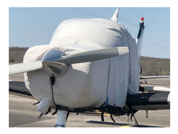
Beech Sundowner Engine Cover

This cover type is made from Silver Acrylic Sunbrella canvas and is 100% lined with a soft and smooth microfiber. Bruce's Custom Covers developed this material combination especially for aircraft protection. The outer material is medium weight and treated for water resistance, UV resistance and anti-static buildup. The inner lining is a very soft and smooth microfiber to prevent scratching. The material is very reflective, and tests show that the cabin interior temperature can be reduced to near-ambient temperature on the hottest of days. It is water, ice and snow repellent, yet breathable to allow moisture to escape from between the cover and the aircraft surface.