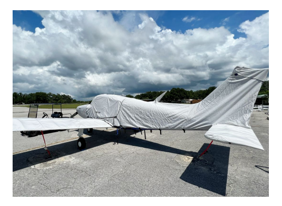
Beech Musketeer A23 Cover Set