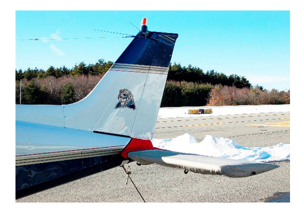
Tailcone & Horizontal Stabilizer Covers

WINTER USE MATERIAL - Made with Solution-Dyed Polyester fabric, this option is intended for seasonal use to aid in deicing, rain mitigation, or for occasional travel. The material is lighter and more compact, but more susceptible to UV damage and may have a shorter useful life if used continuously outside than the all-year use material.