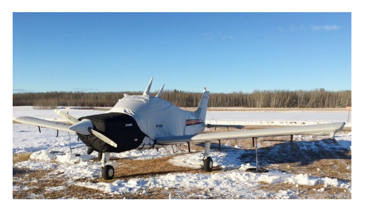
Beech Sport Insulated Engine Cover & Winter Cover Set