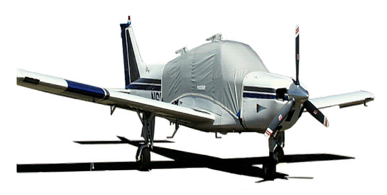
Beech Sport Canopy Cover

This cover type is made from Silver Acrylic Sunbrella canvas and is 100% lined with a soft and smooth microfiber. Bruce's Custom Covers developed this material combination especially for aircraft protection. The outer material is medium weight and treated for water resistance, UV resistance and anti-static buildup. The inner lining is a very soft and smooth microfiber to prevent scratching. The material is very reflective, and tests show that the cabin interior temperature can be reduced to near-ambient temperature on the hottest of days. It is water, ice and snow repellent, yet breathable to allow moisture to escape from between the cover and the aircraft surface.