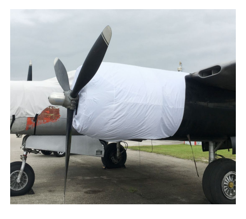
Douglas A-26 Engine Cover, test fit cover