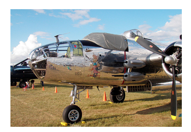
Mitchell B25 Cockpit Cover (Snap-On Type)

Engine Inlet Plugs are custom fit for your Douglas A26 Invader intakes, made with heavy-duty vinyl material, and stuffed with a single block of sculpted urethane foam. Each plug has a zipper that allows the foam to be removed and dried if necessary. Engine plugs have warning flags that are visible from the cockpit or 'remove before flight' streamers sewn onto the face of the plugs. Most plugs are imprinted with the aircraft registration number in black for an extra charge. Storage bag NOT included. Engine plugs may be inserted after flight when the engine is still warm. Engine Inlet Plugs are commonly referred to as Cowl Plugs, Intake Plugs, Cowl Blocks, Engine Blocks, and Engine Bungs.