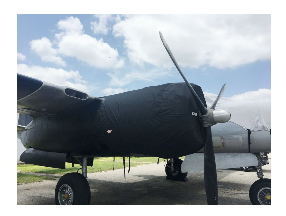
Douglas A-26 Engine Cover