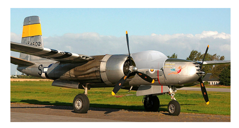
A-26 Invader Cockpit Cover (Illustration)

the hottest of days. It is water, ice and snow repellent, yet breathable to allow moisture to escape from between the cover and the aircraft surface.