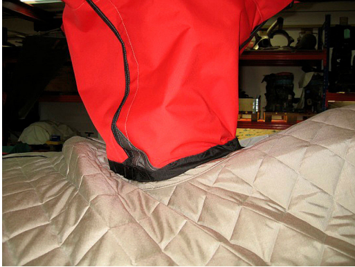
Alouette III Rotor Hub Cover & Engine/Transmission Cover

WINTER USE MATERIAL - Made with Solution-Dyed Polyester fabric, this option is intended for seasonal use to aid in deicing, rain mitigation, or for occasional travel. The material is lighter and more compact, but more susceptible to UV damage and may have a shorter useful life if used continuously outside than the all-year use material.