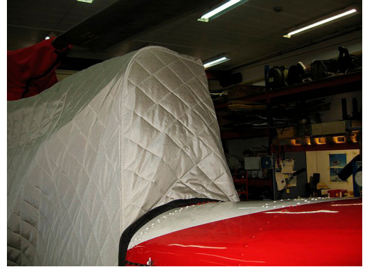
Alouette III Insulated Engine/Transmission Cover