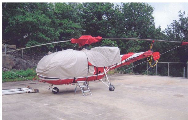
Alouette III Bubble, Rotor Hub & Engine Covers, Blade Tie-Downs