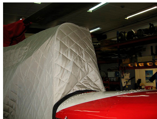
Alouette III Insulated Engine/Transmission Cover