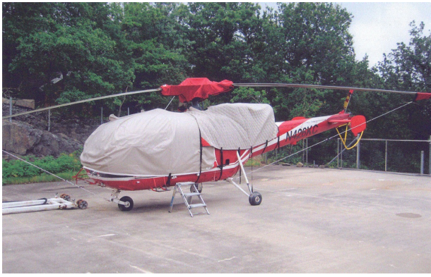
Alouette III Bubble, Rotor Hub & Engine Covers, Blade Tie-Downs