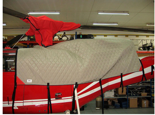
Alouette III Rotor Hub Cover & Engine/Transmission Cover Alouette III Rotor Hub Cover, Insulated Engine/Transmission Cover