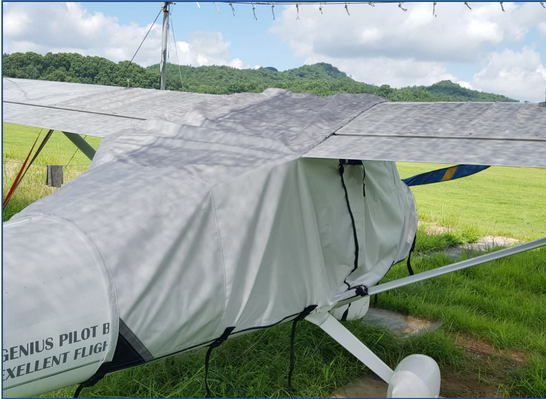
Aeroprakt A-32 Vixxen Canopy Cover, Over-Top Type