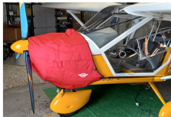
Aeroprakt A-22 Insulated Engine Cover