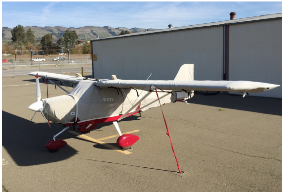
Eurofox Canopy, Engine, Wings and Empennage Covers

shorter useful life if used continuously outside than the all-year use material.