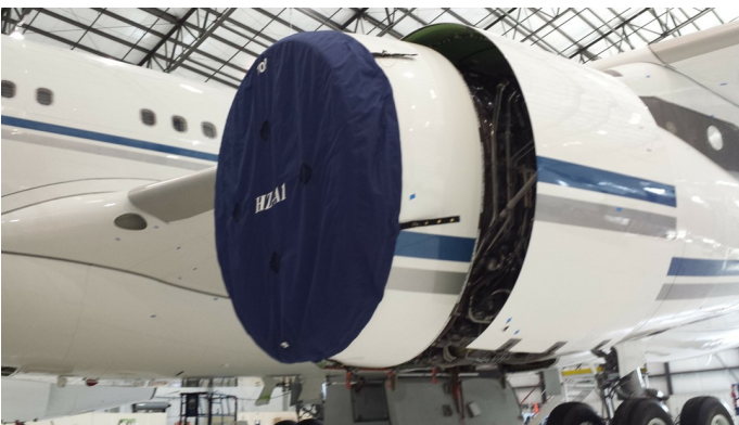
Airbus 340 Intake Covers

The Engine Inlet Plugs are custom fit for your Airbus A320 intakes, made with heavy-duty vinyl material, and stuffed with a single block of sculpted urethane foam. Each plug has a zipper that allows the foam to be removed and dried if necessary. Engine plugs have 'remove before flight' streamers sewn onto the face of the plugs. Most plugs are imprinted with the aircraft registration number in black for an extra charge. Storage bag NOT included. Engine plugs may be inserted after flight when the engine is still warm. Engine Inlet Plugs are commonly referred to as Cowl Plugs, Intake Plugs, Cowl Blocks, Engine Blocks, and Engine Bungs.