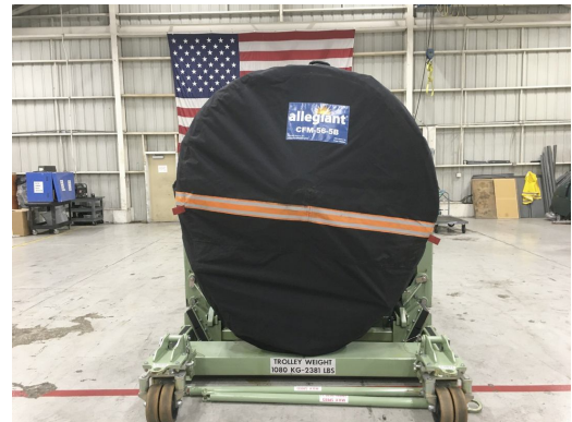
CFM56-5B Off Link Cover, fully enclosed