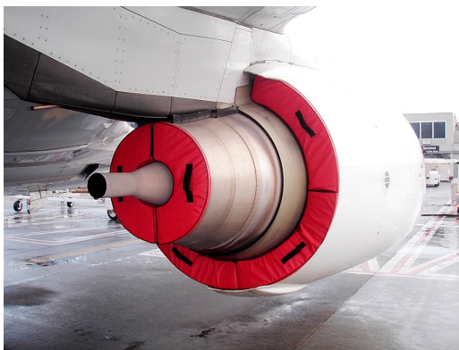
Boeing 737 NG Exhaust Plug Set, Folding Donut Ring Type

The Engine Inlet Plugs are custom fit for your Airbus A320 intakes, made with heavy-duty vinyl material, and stuffed with a single block of sculpted urethane foam. Each plug has a zipper that allows the foam to be removed and dried if necessary. Engine plugs have 'remove before flight' streamers sewn onto the face of the plugs. Most plugs are imprinted with the aircraft registration number in black for an extra charge. Storage bag NOT included. Engine plugs may be inserted after flight when the engine is still warm. Engine Inlet Plugs are commonly referred to as Cowl Plugs, Intake Plugs, Cowl Blocks, Engine Blocks, and Engine Bungs.