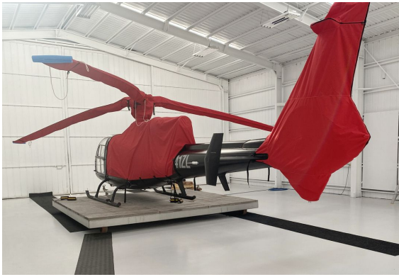
Aerospatiale Gazelle Engine, Rotor Hub, Blades & Tailfan Covers