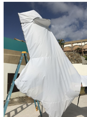
Aerospatiale Gazelle AS341 Tailfan Housing Extended Cover (test fit cover)