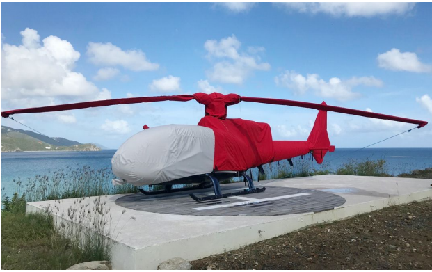
Aerospatiale AS341/342 Gazelle Full Cover Set