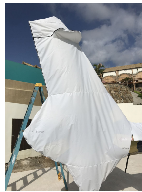
Aerospatiale Gazelle AS341 Tailfan Housing Extended Cover (test fit cover)