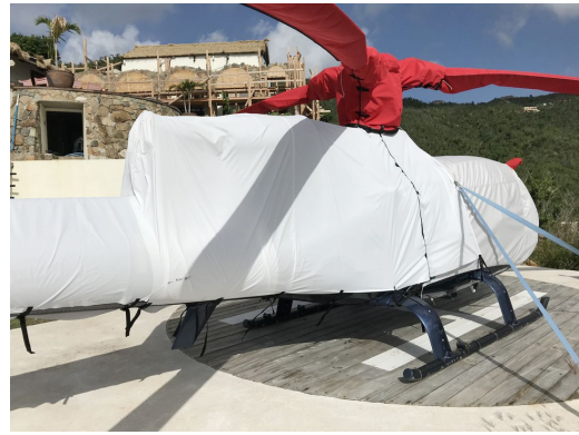
Aerospatiale Gazelle AS341 Bubble, Rotor Mast, Blade, Engine & Tailboom Covers (some are test fit covers)