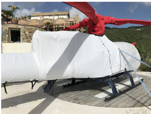
Aerospatiale Gazelle AS341 Bubble, Rotor Mast, Blade, Engine & Tailboom Covers (some are test fit covers)