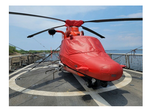
Aerospatiale AS365N2 Bubble, w/Extended Nose/Radome