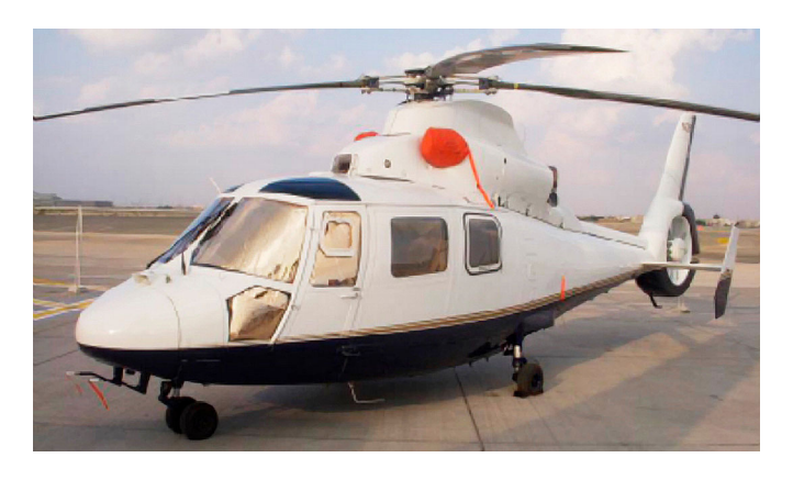
Dauphin HeatShield Set

foam with a silver mylar finish. The semi-rigid design is stiff enough to stand along the inside of the windshield using sun visors or window framing. It folds up flat and easily stores in the included storage sleeve. Some designs may require velcro and suction cups. A Heatshield is an excellent short-term remedy for cockpit overheating.