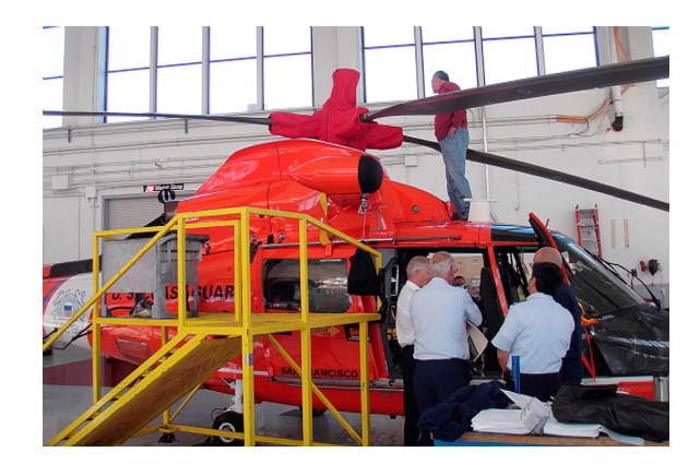
MH-65C Rotor Hub Cover w/ OADS Tube Cover detail

Insulated Covers Material - A special composite material of solution-dyed polyester, 3M Thinsulate insulation, and soft nylon interior fabric. Our insulated covers are designed to complement an engine preheater and help retain heat in the engine compartment after shutdown. If you operate your aircraft in cold-weather, these covers will help prevent engine wear and tear.