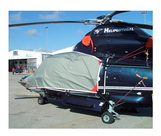
Dauphin Bubble Cover, extended nose