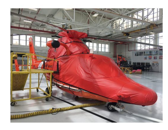
U.S. Coast Guard HH-65 Dolphin Bubble, Engine & Rotor Mast Covers

This cover type is made from Silver Acrylic Sunbrella canvas and is 100% lined with a soft and smooth microfiber. Bruce's Custom Covers developed this material combination especially for aircraft protection. The outer material is medium weight and treated for water resistance, UV resistance and anti-static buildup. The inner lining is a very soft and smooth microfiber to prevent scratching. The material is very reflective, and tests show that the cabin interior temperature can be reduced to near-ambient temperature on the hottest of days. It is water, ice and snow repellent, yet breathable to allow moisture to escape from between the cover and the aircraft surface.