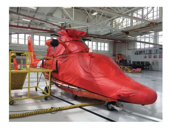
U.S. Coast Guard HH-65 Dolphin Bubble, Engine & Rotor Mast U.S. Coast Guard HH-65 Dolphin Bubble, Engine & Rotor Mast Covers Covers