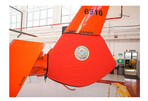
MH-365C Dauphin Tail Fan Fenestron Cover

The Tailboom Cover details vary by model, but generally the helicopter tail boom cover encloses the tail boom from the "bottleneck" to the aft end. They usually also cover the horizontal stabilizers, and are custom made to allow for antennae, lights, and other protrusions. They attach with straps underneath the tail boom. Covers for the vertical and horizontal stabilizers are also available separately. Specific information for each model is available on request.