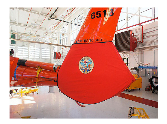
MH-365C Dauphin Tail Fan Fenestron Cover